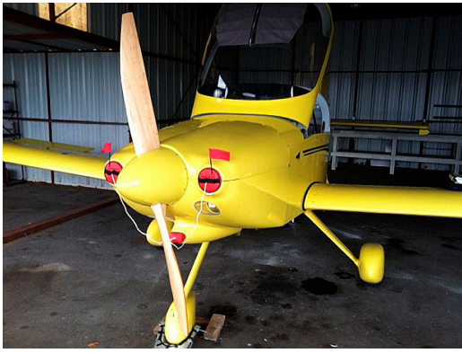
Van's RV-9A Engine Inlet Plugs