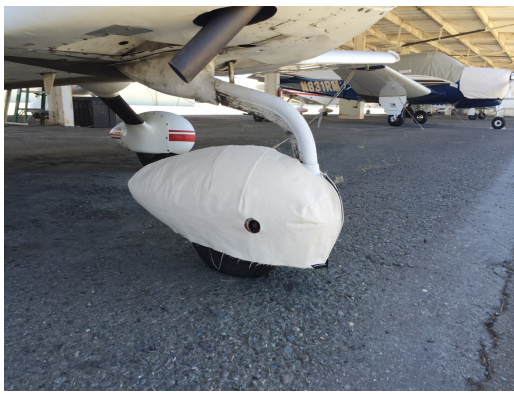
Grumman AA5 Nose Wheelpant Cover, test fit