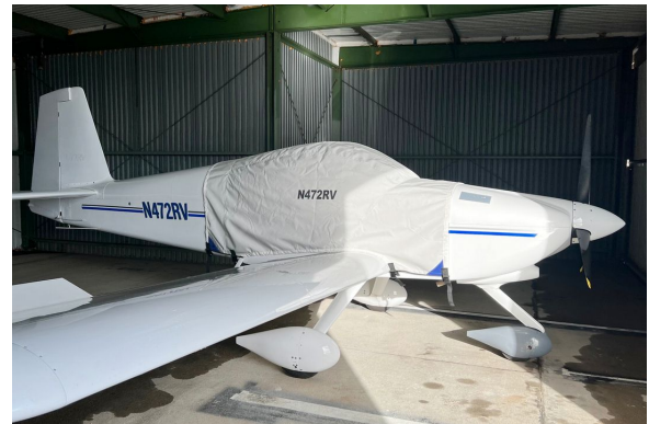
Vans RV-9A Extended Canopy Cover