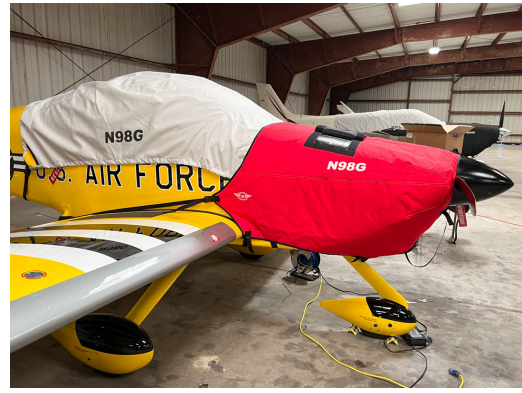
Van's Aircraft RV-7/7A Insulated Engine Cover