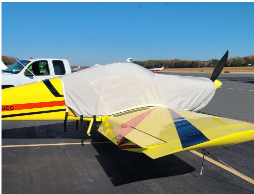
Van's RV-6A Extended Canopy/Engine Cover

This cover type is made from Silver Acrylic Sunbrella canvas and is 100% lined with a soft and smooth microfiber. Bruce's Custom Covers developed this material combination especially for aircraft protection. The outer material is medium weight and treated for water resistance, UV resistance and anti-static buildup. The inner lining is a very soft and smooth microfiber to prevent scratching. The material is very reflective, and tests show that the cabin interior temperature can be reduced to near-ambient temperature on the hottest of days. It is water, ice and snow repellent, yet breathable to allow moisture to escape from between the cover and the aircraft surface.