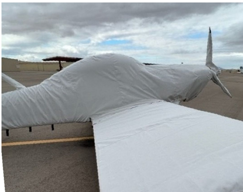
Van's RV-8 Complete Cover Set

This cover type is made from Silver Acrylic Sunbrella canvas and is 100% lined with a soft and smooth microfiber. Bruce's Custom Covers developed this material combination especially for aircraft protection. The outer material is medium weight and treated for water resistance, UV resistance and anti-static buildup. The inner lining is a very soft and smooth microfiber to prevent scratching. The material is very reflective, and tests show that the cabin interior temperature can be reduced to near-ambient temperature on the hottest of days. It is water, ice and snow repellent, yet breathable to allow moisture to escape from between the cover and the aircraft surface.