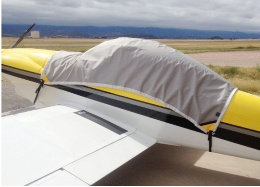
Van's Aircraft RV-4 Travel Cover, Light Weight Travel Canopy Cover, W/15" Fwd Extension, Belly Strap Type

Travel Covers are made with Silver Solution-Dyed Polyester fabric and only lined over the windshield to save weight. The material is lightweight and more compact for easy stowage in the aircraft. The polyester material is water resistant, but only intended for occasional use outside. We also have an ultra lightweight material available for fitted hangar dust covers. For daily outdoor use, the non-travel Sunbrella Cover is the best choice.