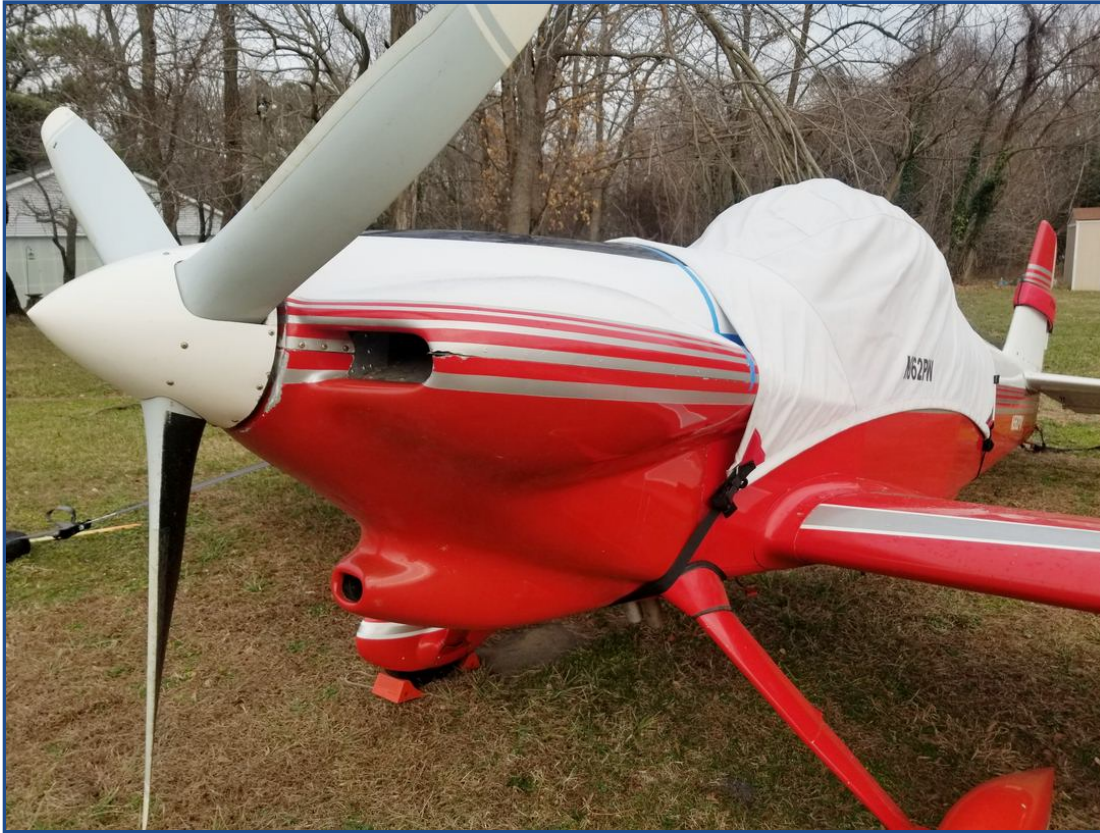
Van's RV-4 Canopy Cover