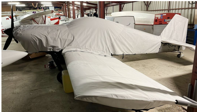
Van's Aircraft RV-4 Complete Fuselage Cover W/Detachable Wing Covers

This cover type is made from Silver Acrylic Sunbrella canvas and is 100% lined with a soft and smooth microfiber. Bruce's Custom Covers developed this material combination especially for aircraft protection. The outer material is medium weight and treated for water resistance, UV resistance and anti-static buildup. The inner lining is a very soft and smooth microfiber to prevent scratching. The material is very reflective, and tests show that the cabin interior temperature can be reduced to near-ambient temperature on the hottest of days. It is water, ice and snow repellent, yet breathable to allow moisture to escape from between the cover and the aircraft surface.