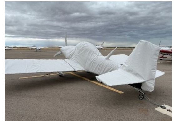
Van's RV-8 Complete Cover Set