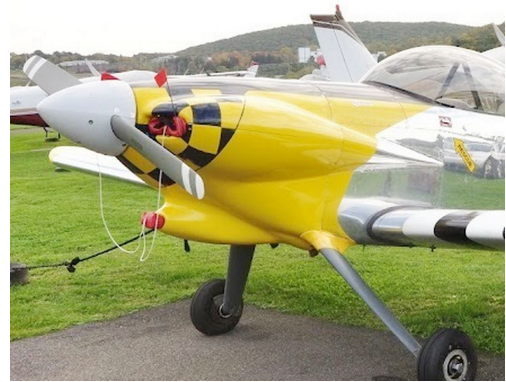
Van's RV-4 Engine Plugs