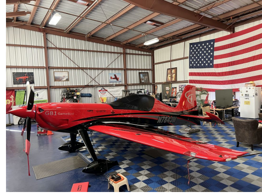
Gamebird GB-1 Solar Cap (single place), CUSTOM COVERS & IMPRINTING AVAILABLE!