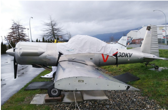
Van's RV-3 (modified) Canopy Cover

This cover type is made from Silver Acrylic Sunbrella canvas and is 100% lined with a soft and smooth microfiber. Bruce's Custom Covers developed this material combination especially for aircraft protection. The outer material is medium weight and treated for water resistance, UV resistance and anti-static buildup. The inner lining is a very soft and smooth microfiber to prevent scratching. The material is very reflective, and tests show that the cabin interior temperature can be reduced to near-ambient temperature on the hottest of days. It is water, ice and snow repellent, yet breathable to allow moisture to escape from between the cover and the aircraft surface.