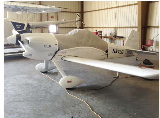
Van's RV-3 Light Weight Travel Cover