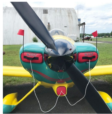
Van's Aircraft RV-4 Engine Inlet Plugs