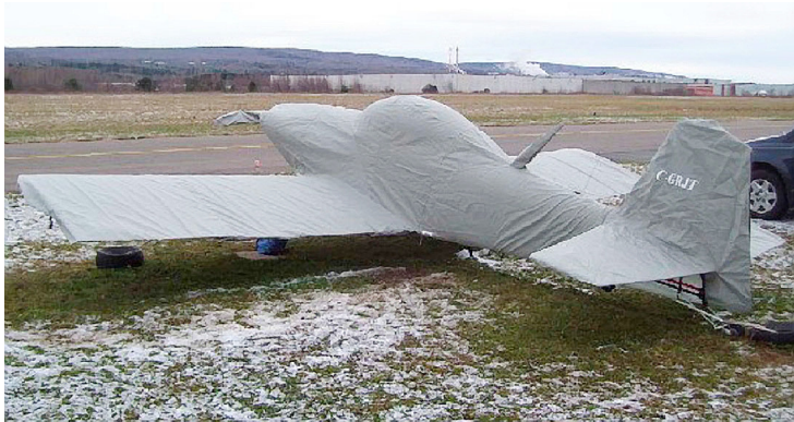
Van's RV-4 Complete Fuselage/Wing/Tail Surfaces cover