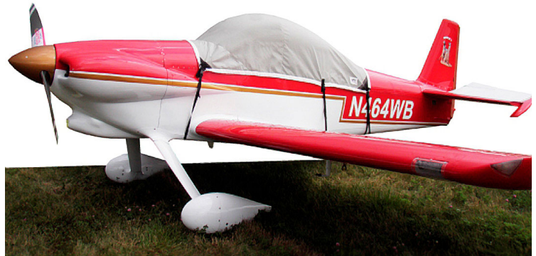
Vans's RV-3 Canopy Cover