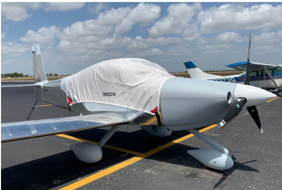
RV-10 Canopy Cover

This cover type is made from Silver Acrylic Sunbrella canvas and is 100% lined with a soft and smooth microfiber. Bruce's Custom Covers developed this material combination especially for aircraft protection. The outer material is medium weight and treated for water resistance, UV resistance and anti-static buildup. The inner lining is a very soft and smooth microfiber to prevent scratching. The material is very reflective, and tests show that the cabin interior temperature can be reduced to near-ambient temperature on the hottest of days. It is water, ice and snow repellent, yet breathable to allow moisture to escape from between the cover and the aircraft surface.