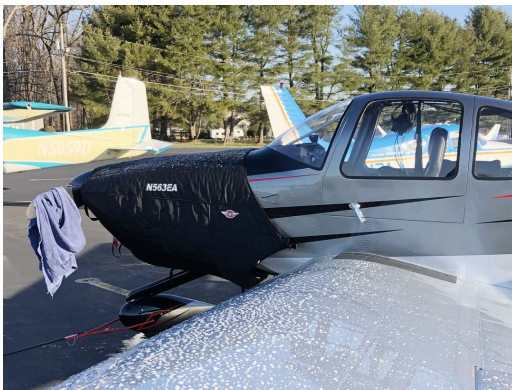
Van's RV-10 Insulated Engine Cover

This cover type is made from Silver Acrylic Sunbrella canvas and is 100% lined with a soft and smooth microfiber. Bruce's Custom Covers developed this material combination especially for aircraft protection. The outer material is medium weight and treated for water resistance, UV resistance and anti-static buildup. The inner lining is a very soft and smooth microfiber to prevent scratching. The material is very reflective, and tests show that the cabin interior temperature can be reduced to near-ambient temperature on the hottest of days. It is water, ice and snow repellent, yet breathable to allow moisture to escape from between the cover and the aircraft surface.