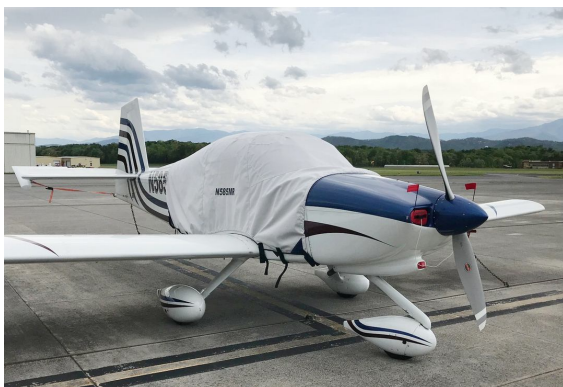
Van's RV-10 Extended Canopy Cover

Engine Inlet Plugs are custom fit for your Van's Aircraft RV-10 intakes, made with heavy-duty vinyl material, and stuffed with a single block of sculpted urethane foam. Each plug has a zipper that allows the foam to be removed and dried if necessary. Engine plugs have warning flags that are visible from the cockpit or 'remove before flight' streamers sewn onto the face of the plugs. Most plugs are imprinted with the aircraft registration number in black for an extra charge. Storage bag NOT included. Engine plugs may be inserted after flight when the engine is still warm. Engine Inlet Plugs are commonly referred to as Cowl Plugs, Intake Plugs, Cowl Blocks, Engine Blocks, and Engine Bungs.