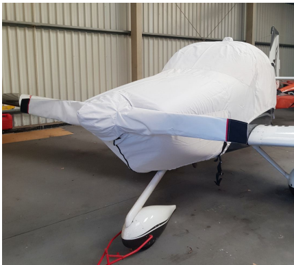
Van's RV-10 Canopy/Engine Cover