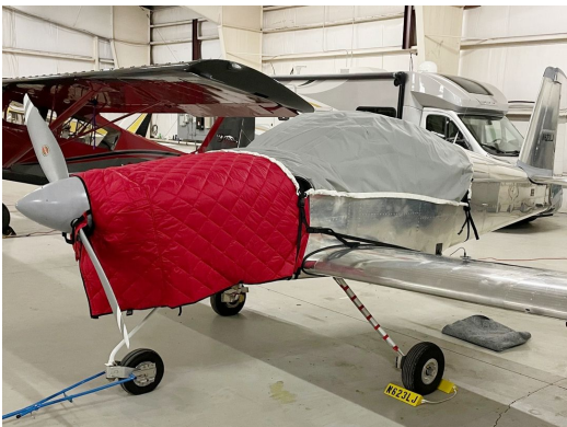
Vans RV-7 Travel Canopy Cover, Hangar Blanket