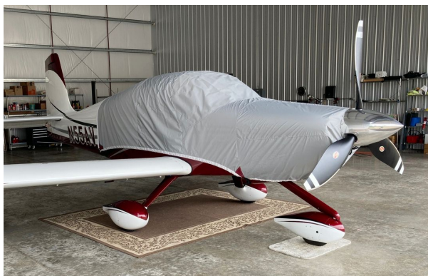
Van's RV-10 Travel Cover

Travel Covers are made with Silver Solution-Dyed Polyester fabric and only lined over the windshield to save weight. The material is lightweight and more compact for easy stowage in the aircraft. The polyester material is water resistant, but only intended for occasional use outside. We also have an ultra lightweight material available for fitted hangar dust covers. For daily outdoor use, the non-travel Sunbrella Cover is the best choice.