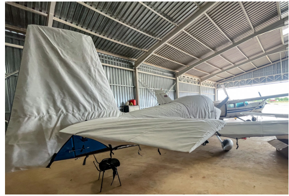
Van's RV-10 Full Cover Set