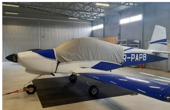
Van's RV-10 Travel Weight Canopy Cover