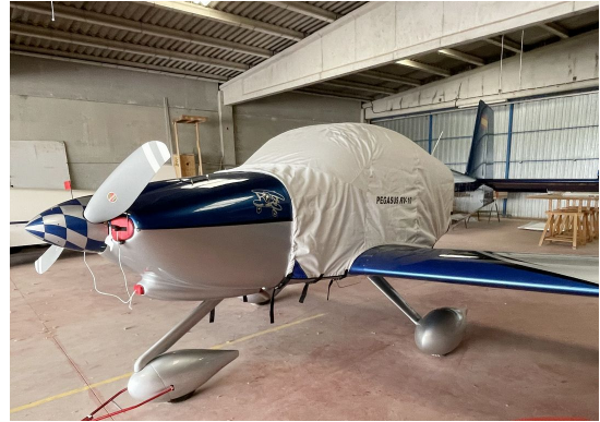
Van's RV-10 Extended Canopy Cover, Engine Plugs