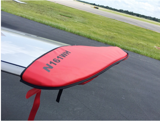
Cirrus SR-20/22 Wingtip Pads

Designed to prevent damage to the aircraft extremities in crowded hangars, these products are made of bright red Naugahyde and thickly padded with a sandwich of closed cell foam.