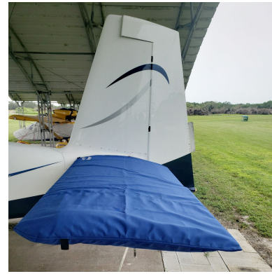
Van's RV-10 Horizontal Stabilizer Covers