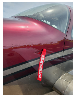
RV-10 Air Vent Wedge Plugs