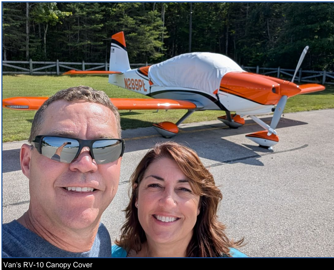
Van's RV-10 Canopy Cover