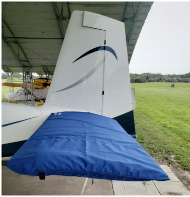
Van's RV-10 Horizontal Stabilizer Covers