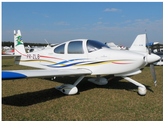
Van's RV-10 HeatShield Set