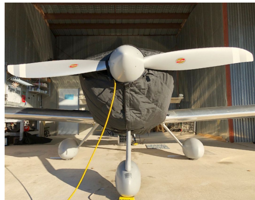
Van's RV-10 Fully Enclosed Insulated Engine Cover