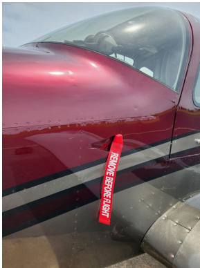
RV-10 Air Vent Wedge Plugs

Engine Inlet Plugs are custom fit for your Van's Aircraft RV-10 intakes, made with heavy-duty vinyl material, and stuffed with a single block of sculpted urethane foam. Each plug has a zipper that allows the foam to be removed and dried if necessary. Engine plugs have warning flags that are visible from the cockpit or 'remove before flight' streamers sewn onto the face of the plugs. Most plugs are imprinted with the aircraft registration number in black for an extra charge. Storage bag NOT included. Engine plugs may be inserted after flight when the engine is still warm. Engine Inlet Plugs are commonly referred to as Cowl Plugs, Intake Plugs, Cowl Blocks, Engine Blocks, and Engine Bungs.