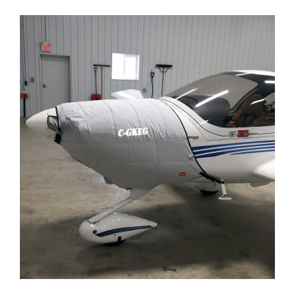
Diamond DA-20-C1 Insulated Engine Cover

This cover type is made from Silver Acrylic Sunbrella canvas and is 100% lined with a soft and smooth microfiber. Bruce's Custom Covers developed this material combination especially for aircraft protection. The outer material is medium weight and treated for water resistance, UV resistance and anti-static buildup. The inner lining is a very soft and smooth microfiber to prevent scratching. The material is very reflective, and tests show that the cabin interior temperature can be reduced to near-ambient temperature on the hottest of days. It is water, ice and snow repellent, yet breathable to allow moisture to escape from between the cover and the aircraft surface.