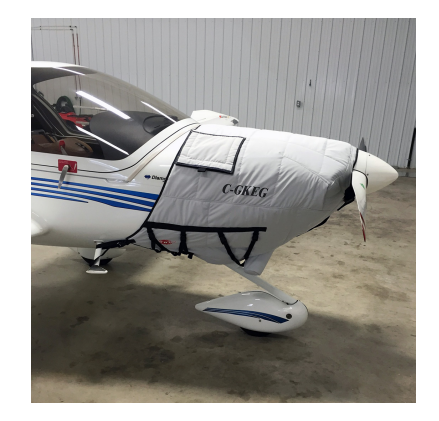
Diamond DA-20-C1 Insulated Engine Cover