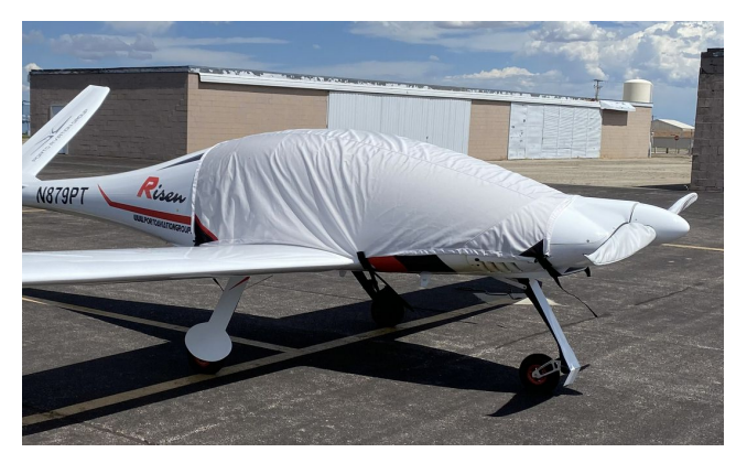
Swiss Excellence Risen 914 Canopy Cover

This cover type is made from Silver Acrylic Sunbrella canvas and is 100% lined with a soft and smooth microfiber. Bruce's Custom Covers developed this material combination especially for aircraft protection. The outer material is medium weight and treated for water resistance, UV resistance and anti-static buildup. The inner lining is a very soft and smooth microfiber to prevent scratching. The material is very reflective, and tests show that the cabin interior temperature can be reduced to near-ambient temperature on the hottest of days. It is water, ice and snow repellent, yet breathable to allow moisture to escape from between the cover and the aircraft surface.