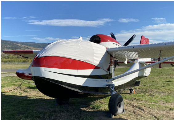
Republic Seabee Canopy Cover