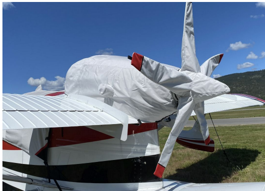
Republic Seabee Canopy, Engine, Prop Cover (5-blade)

The material is very reflective, and tests show that the cabin interior temperature can be reduced to near-ambient temperature on the hottest of days. It is water, ice and snow repellent, yet breathable to allow moisture to escape from between the cover and the aircraft surface.