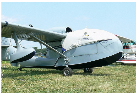
Republic Seabee Canopy Cover

This cover type is made from Silver Acrylic Sunbrella canvas and is 100% lined with a soft and smooth microfiber. Bruce's Custom Covers developed this material combination especially for aircraft protection. The outer material is medium weight and treated for water resistance, UV resistance and anti-static buildup. The inner lining is a very soft and smooth microfiber to prevent scratching. The material is very reflective, and tests show that the cabin interior temperature can be reduced to near-ambient temperature on the hottest of days. It is water, ice and snow repellent, yet breathable to allow moisture to escape from between the cover and the aircraft surface.