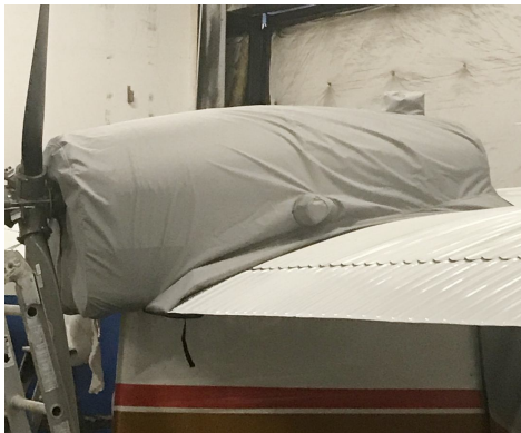
Republic Seabee Amphibian Engine Cover

water resistance, UV resistance and anti-static buildup. The inner lining is a very soft and smooth microfiber to prevent scratching. The material is very reflective, and tests show that the cabin interior temperature can be reduced to near-ambient temperature on the hottest of days. It is water, ice and snow repellent, yet breathable to allow moisture to escape from between the cover and the aircraft surface.