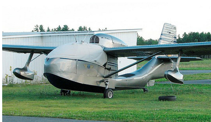
Seabee Canopy Cover