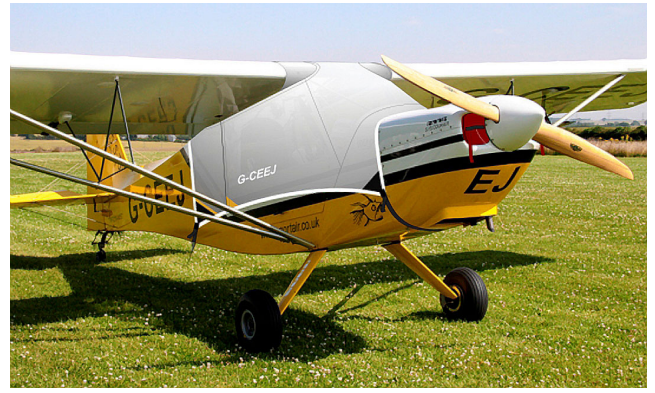
Rans Canopy Cover & Engine Plugs (illustration on a Rans S-7)