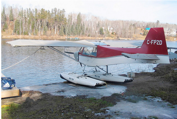
Rans S-7 Insulated Engine Cover, Wing Covers and Horizontal Stabilizer Covers

WINTER USE MATERIAL - Made with Solution-Dyed Polyester fabric, this option is intended for seasonal use to aid in deicing, rain mitigation, or for occasional travel. The material is lighter and more compact, but more susceptible to UV damage and may have a shorter useful life if used continuously outside than the all-year use material.