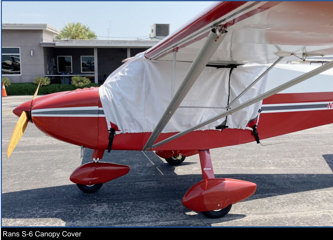
Rans S-6 Canopy Cover