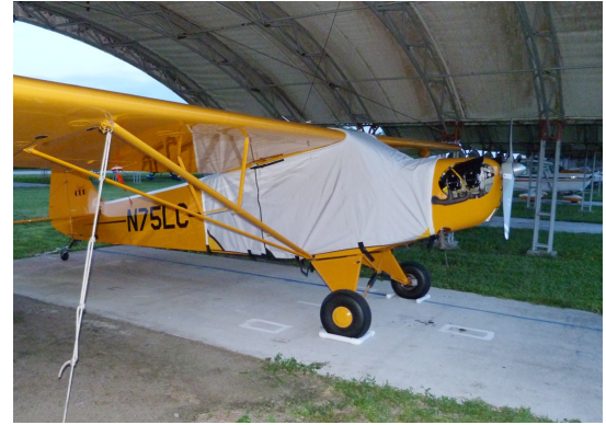
Piper J-3 Extended Canopy Cover