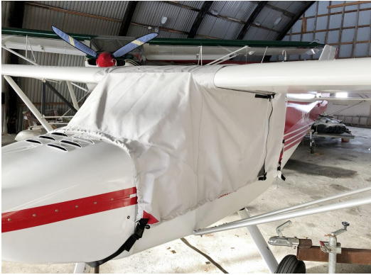
Rans S6S Coyote II Over The Top Style Canopy Cover

This cover type is made from Silver Acrylic Sunbrella canvas and is 100% lined with a soft and smooth microfiber. Bruce's Custom Covers developed this material combination especially for aircraft protection. The outer material is medium weight and treated for water resistance, UV resistance and anti-static buildup. The inner lining is a very soft and smooth microfiber to prevent scratching. The material is very reflective, and tests show that the cabin interior temperature can be reduced to near-ambient temperature on the hottest of days. It is water, ice and snow repellent, yet breathable to allow moisture to escape from between the cover and the aircraft surface.