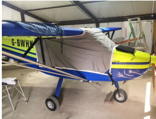
Rans S-6 Coyote Light Weight Travel Canopy Cover

Travel Covers are made with Silver Solution-Dyed Polyester fabric and only lined over the windshield to save weight. The material is lightweight and more compact for easy stowage in the aircraft. The polyester material is water resistant, but only intended for occasional use outside. We also have an ultra lightweight material available for fitted hangar dust covers. For daily outdoor use, the non-travel Sunbrella Cover is the best choice.