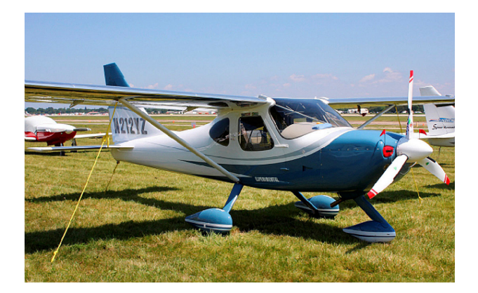
Glastar Sportsman Engine Inlet Plugs

Engine Inlet Plugs are custom fit for your Rans S-21 Outbound intakes, made with heavy-duty vinyl material, and stuffed with a single block of sculpted urethane foam. Each plug has a zipper that allows the foam to be removed and dried if necessary. Engine plugs have warning flags that are visible from the cockpit or 'remove before flight' streamers sewn onto the face of the plugs. Most plugs are imprinted with the aircraft registration number in black for an extra charge. Storage bag NOT included. Engine plugs may be inserted after flight when the engine is still warm. Engine Inlet Plugs are commonly referred to as Cowl Plugs, Intake Plugs, Cowl Blocks, Engine Blocks, and Engine Bungs.