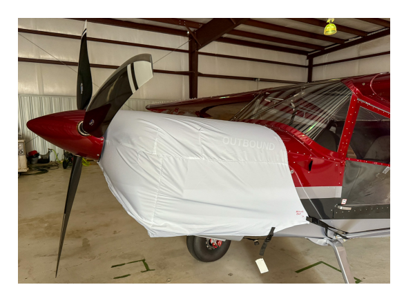
Rans S-21 Engine Cover, test fit cover

the hottest of days. It is water, ice and snow repellent, yet breathable to allow moisture to escape from between the cover and the aircraft surface.