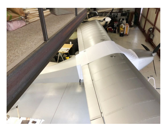
Rans S-20 Canopy Cover, test fit cover