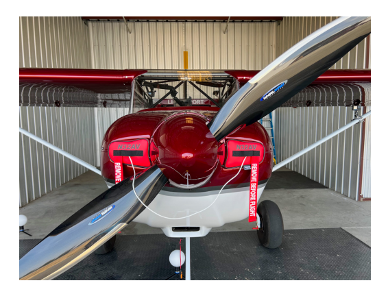
Rans S-21 Engine Plugs