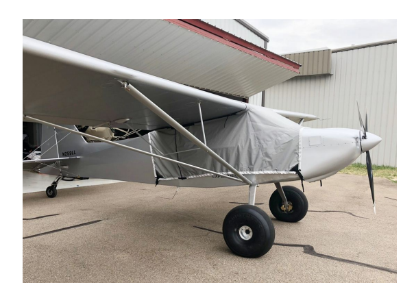
RANS S20 TRAVEL COVER

Travel Covers are made with Silver Solution-Dyed Polyester fabric and only lined over the windshield to save weight. The material is lightweight and more compact for easy stowage in the aircraft. The polyester material is water resistant, but only intended for occasional use outside. We also have an ultra lightweight material available for fitted hangar dust covers. For daily outdoor use, the non-travel Sunbrella Cover is the best choice.