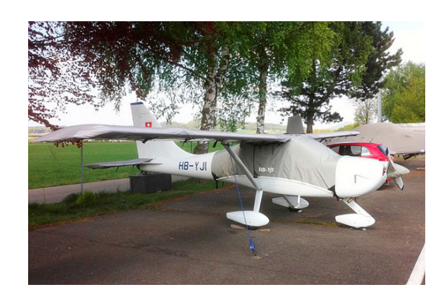
OMF Symphony Canopy, Wings, Horiz. Stab, and Prop Covers