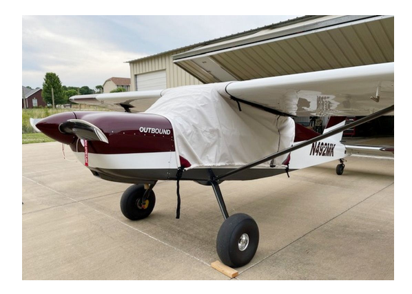
Rans S-21 Outbound Canopy Cover