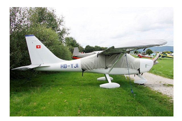
Prop Cover, Engine Cover, Canopy Cover, Wing Covers and Empennage Cover