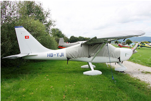
Glastar Canopy, Wings, Horizontal Stab. & Prop Covers