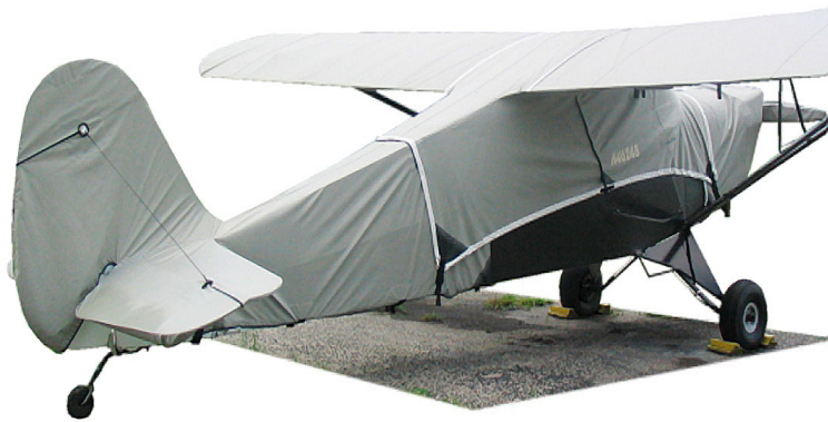
Taylorcraft L-2 Grasshopper Prop, Engine, Canopy, Wing and Empennage Covers

WINTER USE MATERIAL - Made with Solution-Dyed Polyester fabric, this option is intended for seasonal use to aid in deicing, rain mitigation, or for occasional travel. The material is lighter and more compact, but more susceptible to UV damage and may have a shorter useful life if used continuously outside than the all-year use material.