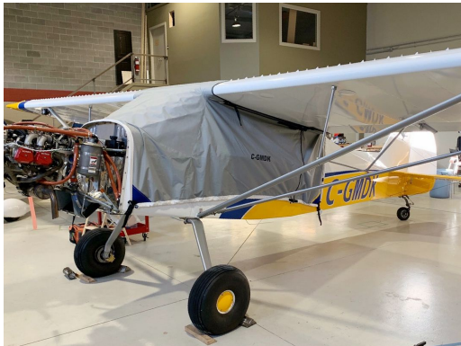
Rans RS20 Travel Weight Canopy Cover

Travel Covers are made with Silver Solution-Dyed Polyester fabric and only lined over the windshield to save weight. The material is lightweight and more compact for easy stowage in the aircraft. The polyester material is water resistant, but only intended for occasional use outside. We also have an ultra lightweight material available for fitted hangar dust covers. For daily outdoor use, the non-travel Sunbrella Cover is the best choice.