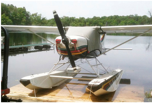
Glastar Sportsman Canopy Cover and Engine Plugs