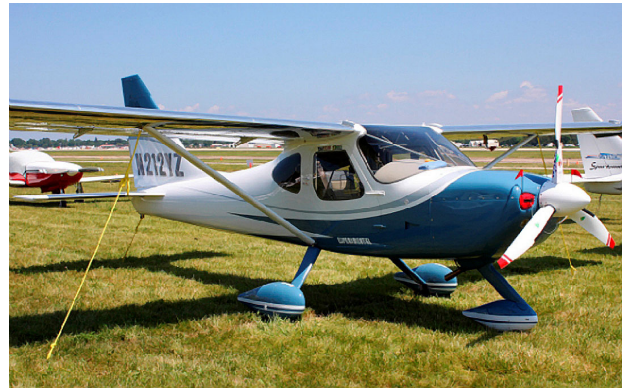
Glastar Sportsman Engine Inlet Plugs