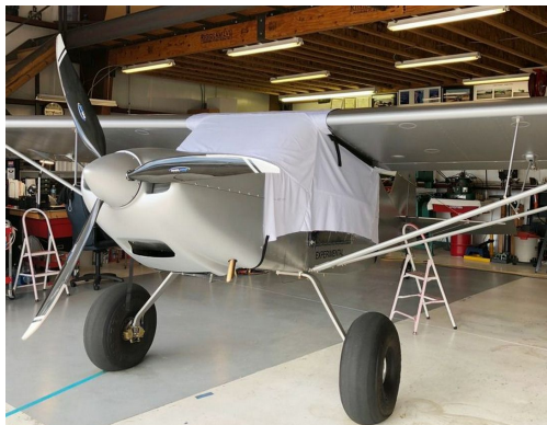
Rans S-20 Canopy Cover, test fit cover

This cover type is made from Silver Acrylic Sunbrella canvas and is 100% lined with a soft and smooth microfiber. Bruce's Custom Covers developed this material combination especially for aircraft protection. The outer material is medium weight and treated for water resistance, UV resistance and anti-static buildup. The inner lining is a very soft and smooth microfiber to prevent scratching. The material is very reflective, and tests show that the cabin interior temperature can be reduced to near-ambient temperature on the hottest of days. It is water, ice and snow repellent, yet breathable to allow moisture to escape from between the cover and the aircraft surface.