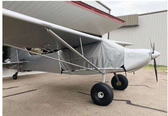
RANS S20 TRAVEL COVER