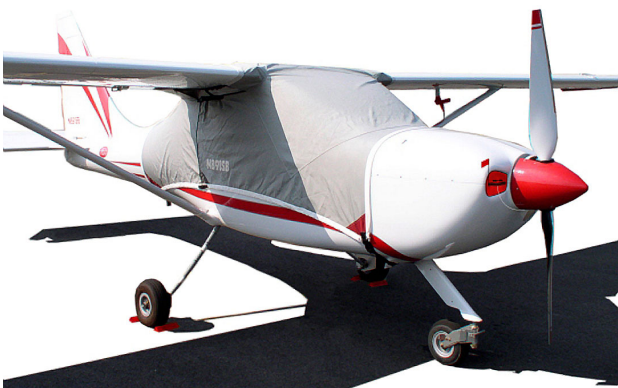
Glastar Over-Top Canopy Cover