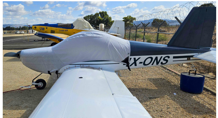
Rans S-19 Canopy/Engine Cover