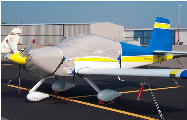
Van's RV-9 Canopy & Engine Covers

This cover type is made from Silver Acrylic Sunbrella canvas and is 100% lined with a soft and smooth microfiber. Bruce's Custom Covers developed this material combination especially for aircraft protection. The outer material is medium weight and treated for water resistance, UV resistance and anti-static buildup. The inner lining is a very soft and smooth microfiber to prevent scratching. The material is very reflective, and tests show that the cabin interior temperature can be reduced to near-ambient temperature on the hottest of days. It is water, ice and snow repellent, yet breathable to allow moisture to escape from between the cover and the aircraft surface.