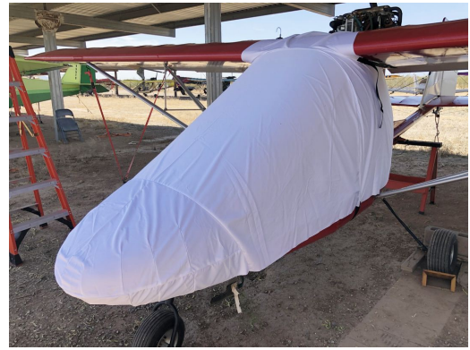
Rans S-12 Airaille Canopy/Nose Cover (test fit cover)