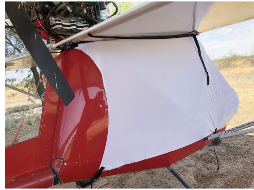
Rans S-12 Airaille Canopy/Nose Cover (test fit cover)