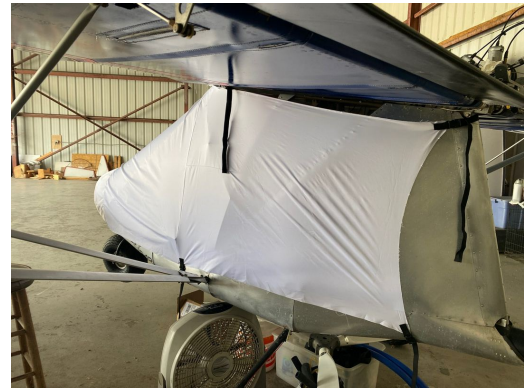
Rans S-12 Canopy/Nose Cover, test fit