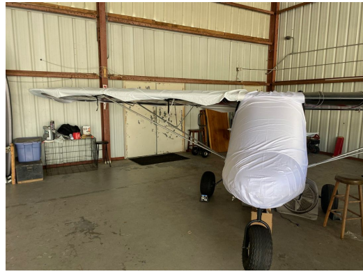
Rans S-12 Canopy/Nose & Wing Covers, test fit