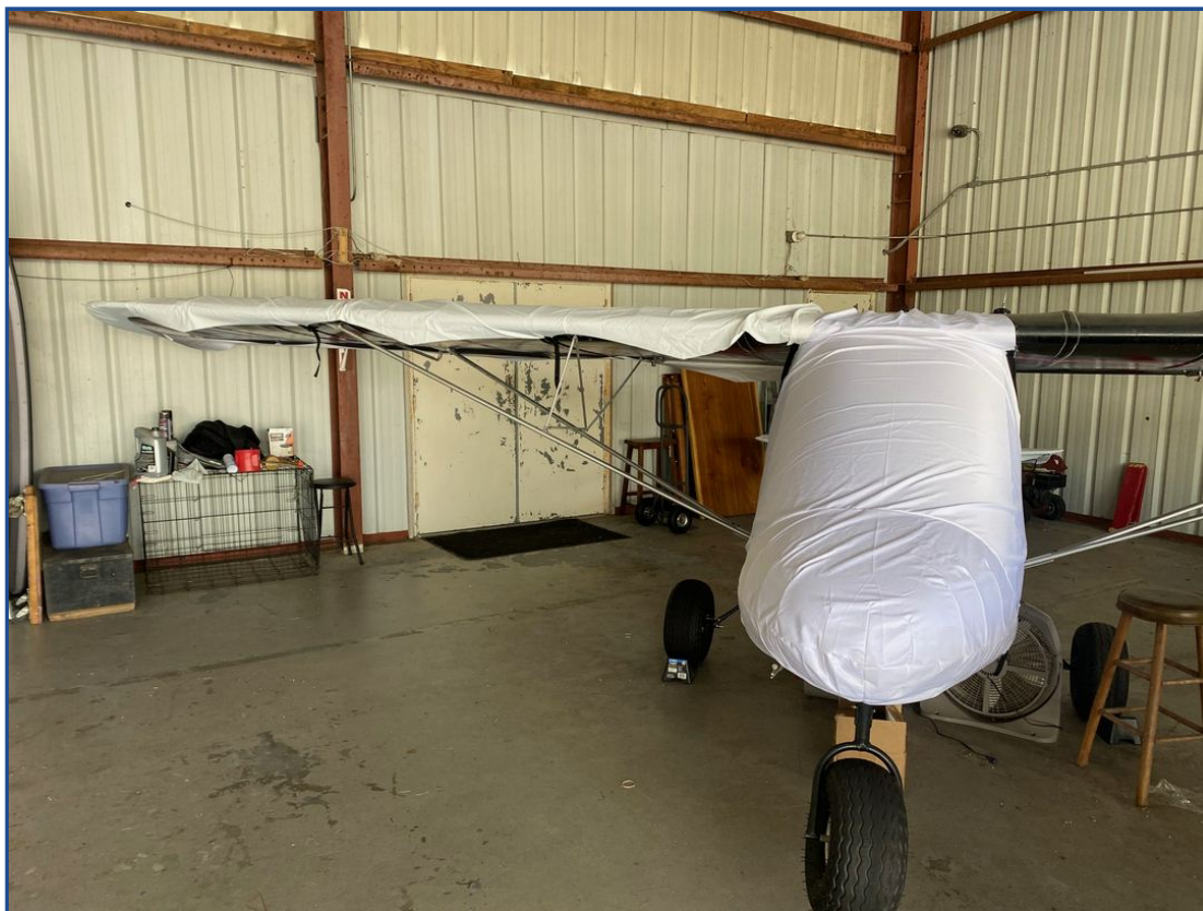
Rans S-12 Canopy/Nose &amp; Wing Covers, test fit