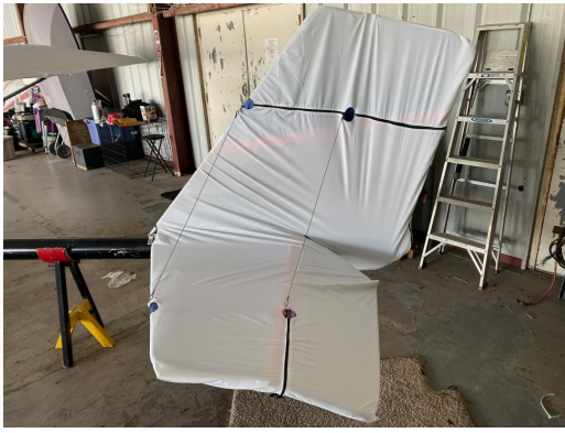
Rans S-12 Empennage Cover, test fit