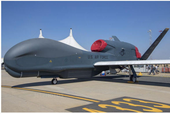
Northrop Grumman Global Hawk Intake & Exhaust Covers