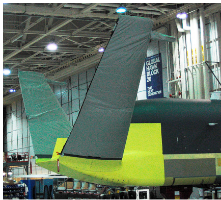
Global Hawk V-tail Stabilizer Covers