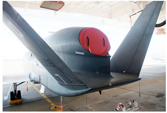
RQ-4/MQ-4 Global Hawk Exhaust Plug w/ lip (Fits both A & B models & all blocks)