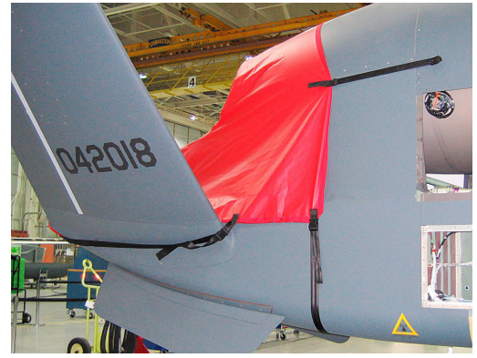
Global Hawk Exhaust Cover