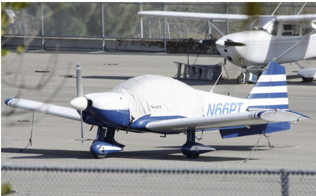
Robin R-2160 Canopy Cover with 12" forward Extension

This cover type is made from Silver Acrylic Sunbrella canvas and is 100% lined with a soft and smooth microfiber. Bruce's Custom Covers developed this material combination especially for aircraft protection. The outer material is medium weight and treated for water resistance, UV resistance and anti-static buildup. The inner lining is a very soft and smooth microfiber to prevent scratching. The material is very reflective, and tests show that the cabin interior temperature can be reduced to near-ambient temperature on the hottest of days. It is water, ice and snow repellent, yet breathable to allow moisture to escape from between the cover and the aircraft surface.