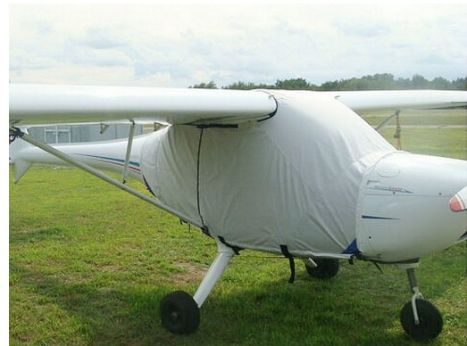
Remos G3 & GX MODELS Extended Canopy Cover (Over-The-Top Style) Remos G3 & GX MODELS Extended Canopy Cover (Over-The-Top Style)