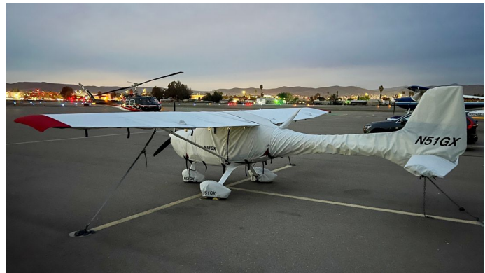
Remos RG-3 Complete Cover Set