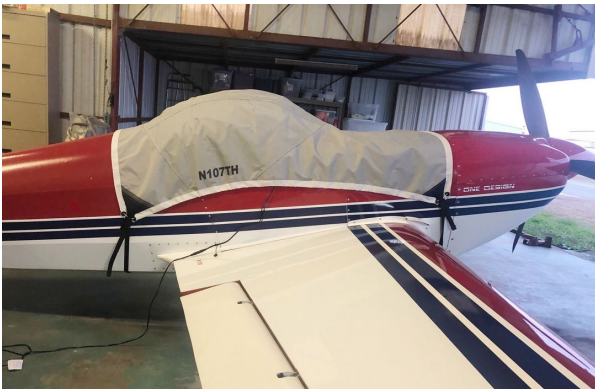
IAC One Design Travel Weight Canopy Cover

Travel Covers are made with Silver Solution-Dyed Polyester fabric and only lined over the windshield to save weight. The material is lightweight and more compact for easy stowage in the aircraft. The polyester material is water resistant, but only intended for occasional use outside. We also have an ultra lightweight material available for fitted hangar dust covers. For daily outdoor use, the non-travel Sunbrella Cover is the best choice.