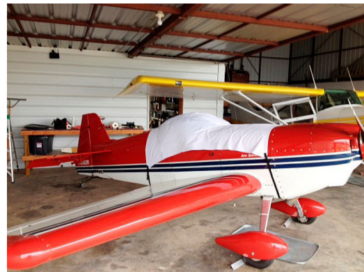
IAC One Design Canopy Cover, test fit cover