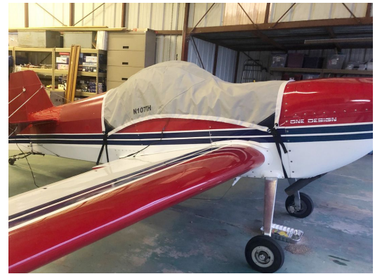
IAC One Design Travel Weight Canopy Cover