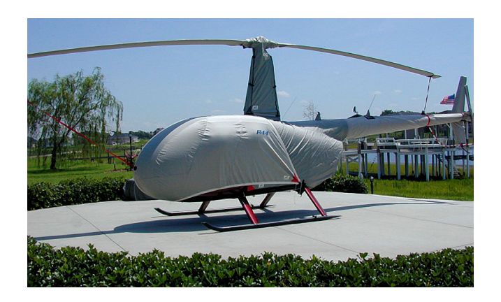
Robinson R-44 Full Cover Set