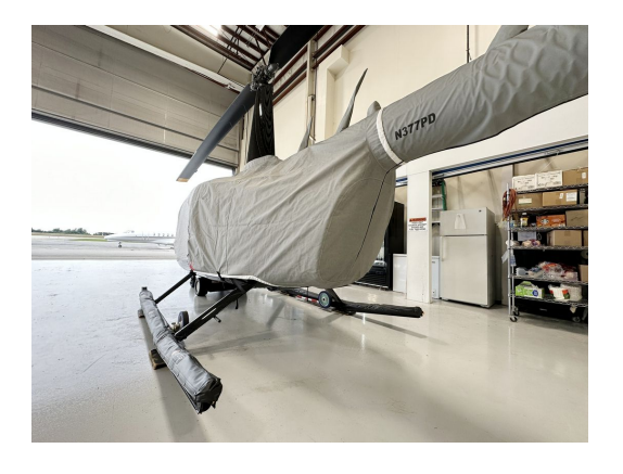
Robinson R-66 Engine & Tailboom Cover