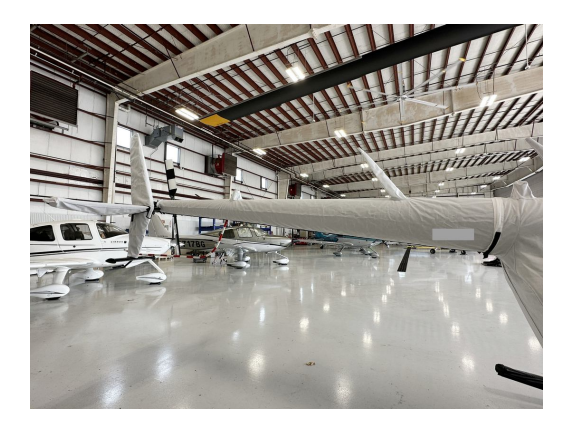
Robinson R-66 Tailboom Cover