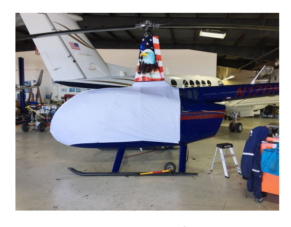
Robinson R-66 Extended Bubble Cover, past rotor mast.