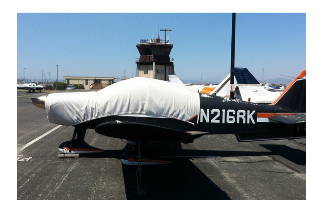
Robin Canopy/Engine Cover

This cover type is made from Silver Acrylic Sunbrella canvas and is 100% lined with a soft and smooth microfiber. Bruce's Custom Covers developed this material combination especially for aircraft protection. The outer material is medium weight and treated for water resistance, UV resistance and anti-static buildup. The inner lining is a very soft and smooth microfiber to prevent scratching. The material is very reflective, and tests show that the cabin interior temperature can be reduced to near-ambient temperature on the hottest of days. It is water, ice and snow repellent, yet breathable to allow moisture to escape from between the cover and the aircraft surface.