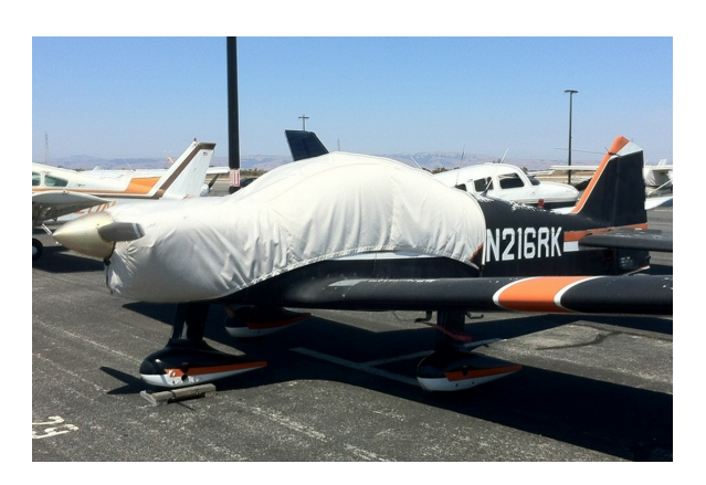
Robin Canopy/Engine Cover