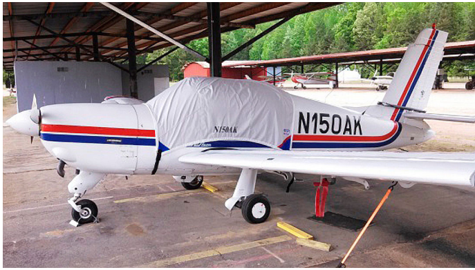
Rallye Canopy Cover