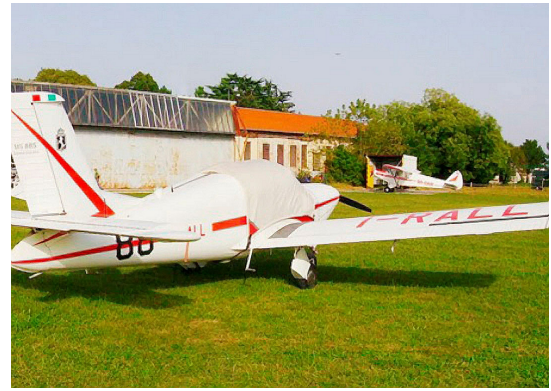
Standard Canopy Cover for MS893A