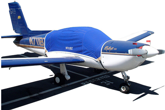
Rallye Canopy Cover