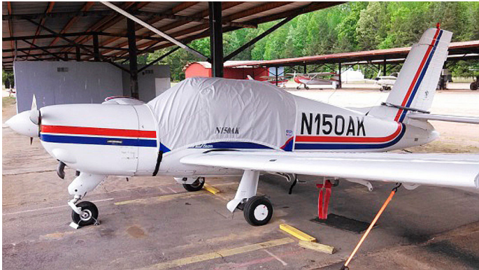
Rallye Canopy Cover

Travel Covers are made with Silver Solution-Dyed Polyester fabric and only lined over the windshield to save weight. The material is lightweight and more compact for easy stowage in the aircraft. The polyester material is water resistant, but only intended for occasional use outside. We also have an ultra lightweight material available for fitted hangar dust covers. For daily outdoor use, the non-travel Sunbrella Cover is the best choice.