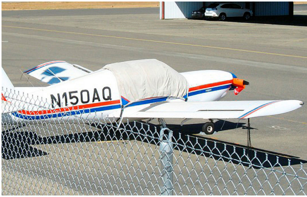
Koliber 150-A Canopy Cover