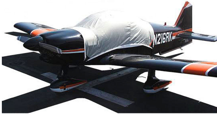
Robin R.2160 Canopy Cover

The Robin DR200 & related Canopy/Engine Cover is a one-piece cover (100% lined with microfiber) that is a combination of the Canopy Cover and Engine Cover. This cover will enclose the engine cowl and will extend aft to cover all of the windows. This cover type is made from Silver Acrylic Sunbrella canvas and is 100% lined with a soft and smooth microfiber. Bruce's Custom Covers developed this material combination especially for aircraft protection. The outer material is medium weight and treated for water resistance, UV resistance and anti-static buildup. The inner lining is a very soft and smooth microfiber to prevent scratching. The material is very reflective, and tests show that the cabin interior temperature can be reduced to near-ambient temperature on the hottest of days. It is water, ice and snow repellent, yet breathable to allow moisture to escape from between the cover and the aircraft surface.