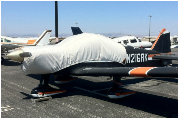
Robin Canopy/Engine Cover