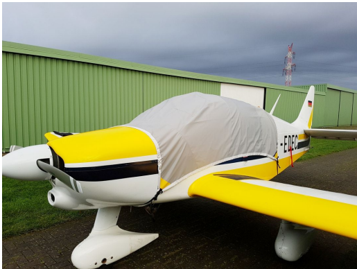
Robin DR400/R Travel Cover, Light Weight Travel Canopy Cover

The Robin DR200 & related Canopy/Engine Cover is a one-piece cover (100% lined with microfiber) that is a combination of the Canopy Cover and Engine Cover. This cover will enclose the engine cowl and will extend aft to cover all of the windows. This cover type is made from Silver Acrylic Sunbrella canvas and is 100% lined with a soft and smooth microfiber. Bruce's Custom Covers developed this material combination especially for aircraft protection. The outer material is medium weight and treated for water resistance, UV resistance and anti-static buildup. The inner lining is a very soft and smooth microfiber to prevent scratching. The material is very reflective, and tests show that the cabin interior temperature can be reduced to near-ambient temperature on the hottest of days. It is water, ice and snow repellent, yet breathable to allow moisture to escape from between the cover and the aircraft surface.