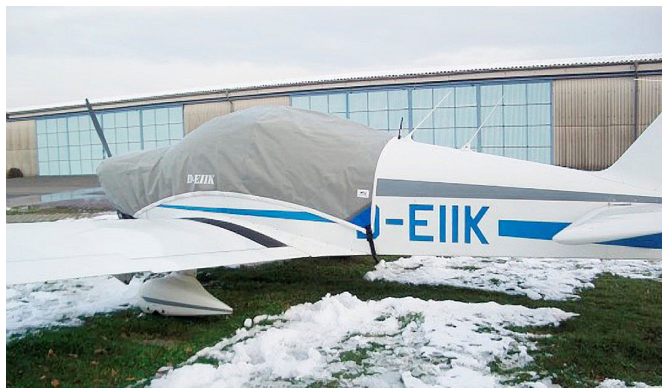
Robin R.2160 Canopy/Engine Cover