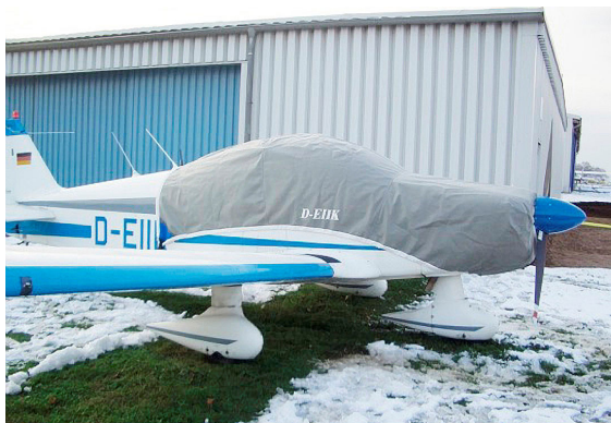
Robin R.2160 Canopy/Engine Cover