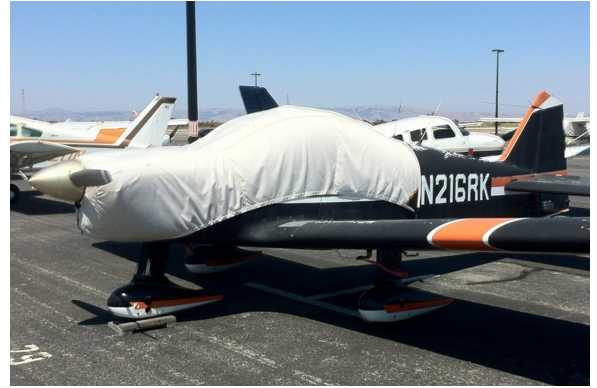
Robin Canopy/Engine Cover