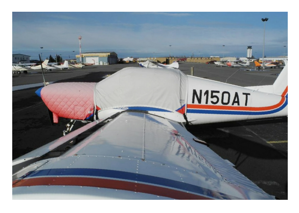
Koliber 150A Canopy Cover, Insulated Engine Cover