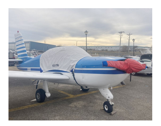
SOCATA Rallye 150 Canopy Cover, Prop Cover