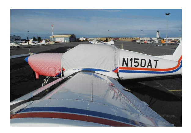
Koliber 150A Canopy Cover, Insulated Engine Cover

This cover type is made from Silver Acrylic Sunbrella canvas and is 100% lined with a soft and smooth microfiber. Bruce's Custom Covers developed this material combination especially for aircraft protection. The outer material is medium weight and treated for water resistance, UV resistance and anti-static buildup. The inner lining is a very soft and smooth microfiber to prevent scratching. The material is very reflective, and tests show that the cabin interior temperature can be reduced to near-ambient temperature on the hottest of days. It is water, ice and snow repellent, yet breathable to allow moisture to escape from between the cover and the aircraft surface.