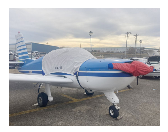
SOCATA Rallye 150 Canopy Cover, Prop Cover