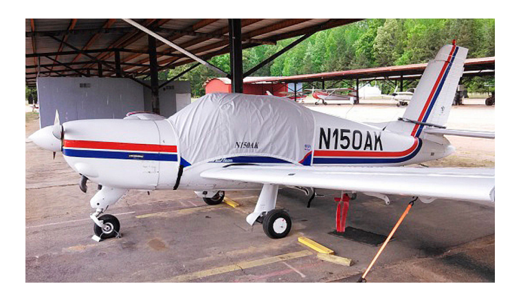
Rallye Canopy Cover