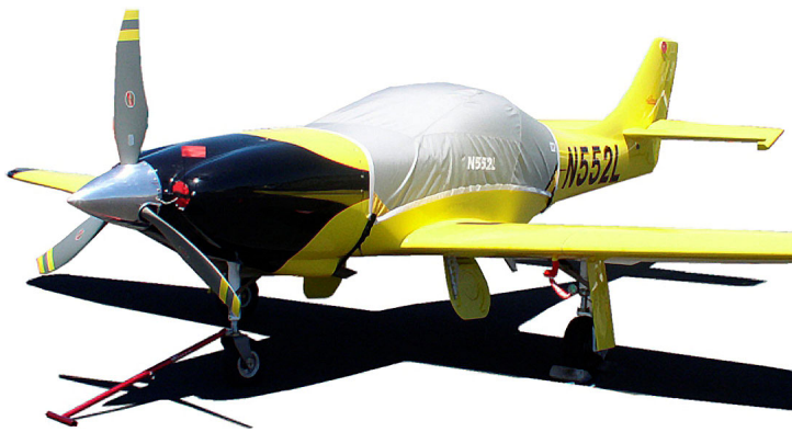
Canopy Cover for Lancair Legacy