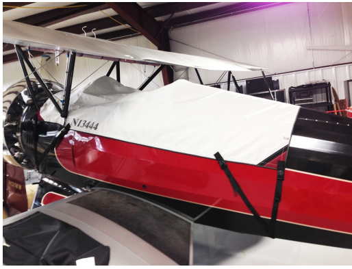
Waco QCF/UBF Canopy Cover