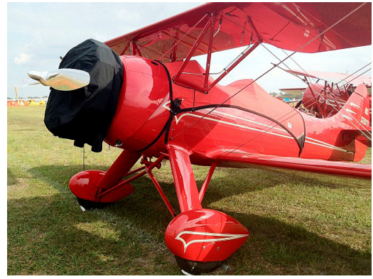
Waco UPF-7 Canopy & Engine Cover