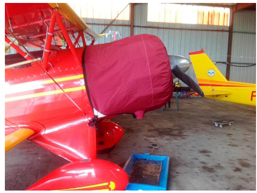
Waco Engine Cover