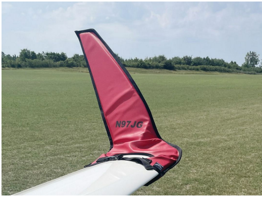
Schempp-Hirth Ventus-2B winglet/wingtip pads