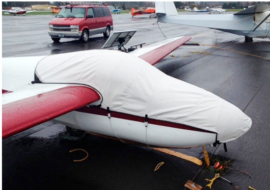
SGS 1-26B Canopy/Nose Cover

Covers developed this material combination especially for aircraft protection. The outer material is medium weight and treated for water resistance, UV resistance and anti-static buildup. The inner lining is a very soft and smooth microfiber to prevent scratching. The material is very reflective, and tests show that the cabin interior temperature can be reduced to near-ambient temperature on the hottest of days. It is water, ice and snow repellent, yet breathable to allow moisture to escape from between the cover and the aircraft surface.