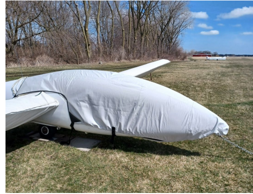
Wsk Pzl-Krosno KR-03A Canopy/Nose Cover