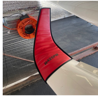
Stemme S-10 & S-12 Wingtip Pads