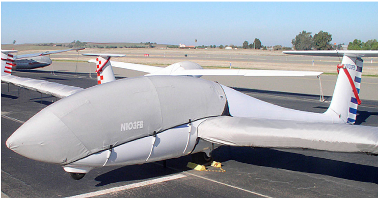
Grob 103 Canopy/Nose Cover and Wing Covers