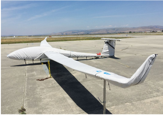
Schemp-Hirth Discus 2B Full Cover Set

Covers developed this material combination especially for aircraft protection. The outer material is medium weight and treated for water resistance, UV resistance and anti-static buildup. The inner lining is a very soft and smooth microfiber to prevent scratching. The material is very reflective, and tests show that the cabin interior temperature can be reduced to near-ambient temperature on the hottest of days. It is water, ice and snow repellent, yet breathable to allow moisture to escape from between the cover and the aircraft surface.