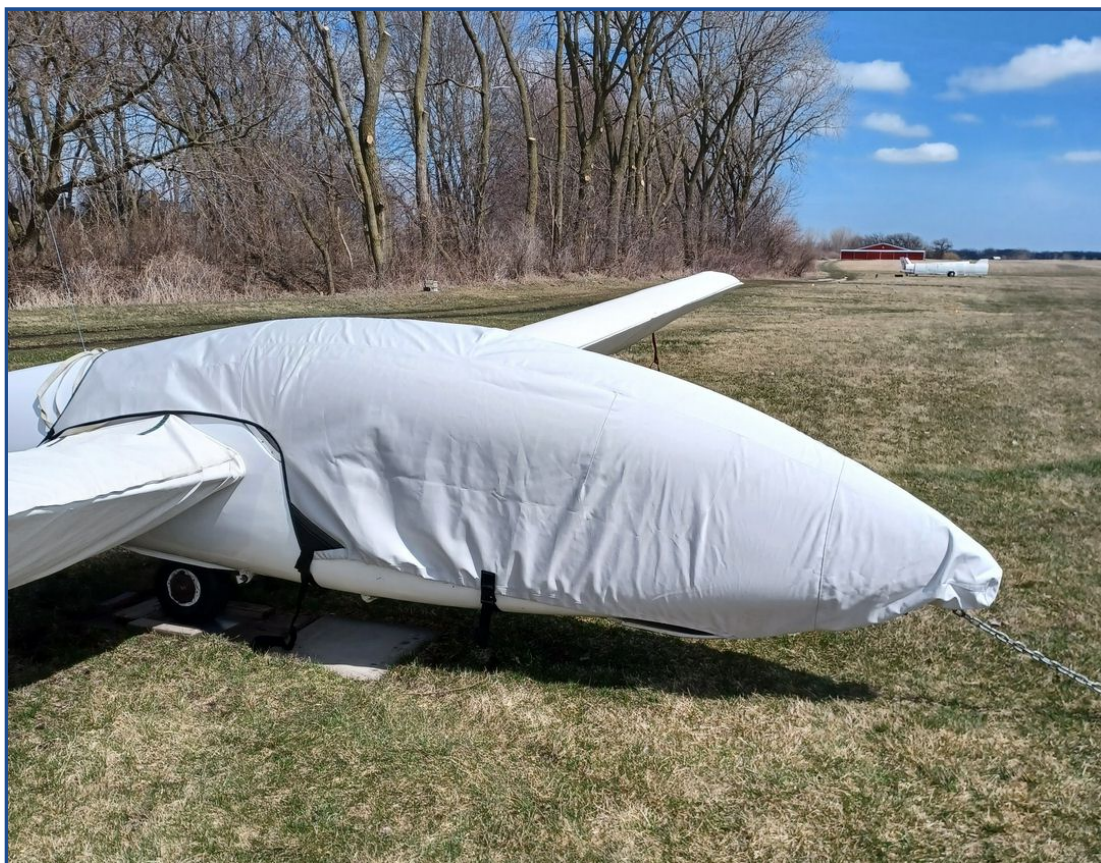
Wsk Pzl-Krosno KR-03A Canopy/Nose Cover