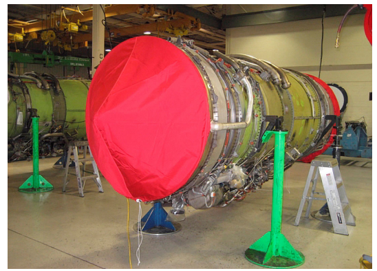
PW JT8D Off-Link Engine Shower Cap Cover Set