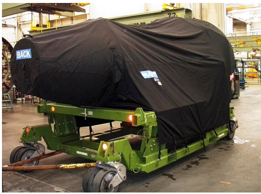
PW 2000 Series OFF-LINK ENGINE STORAGE COVER, Rain Cap