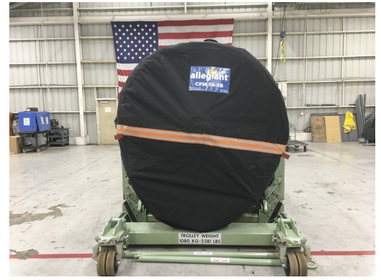
CFM56-5B Off Link Cover, fully enclosed