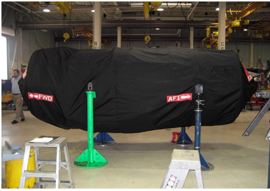
PW JT8D Off-Link Engine Transport Cover (no nose cone, no TR's), fully enclosed