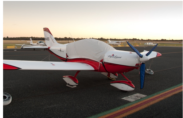
PiperSport Canopy Cover, Engine Plugs