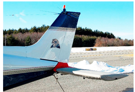
Tailcone & Horizontal Stabilizer Covers