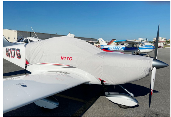
Czech Sportcruiser Canopy/Engine Cover