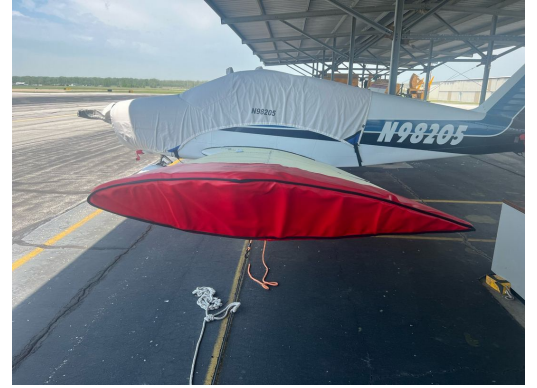
Piper PA-28-140 Wingtip Pads