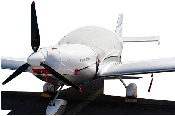
Sportcruiser Canopy Cover & Plugs

have warning flags that are visible from the cockpit or 'remove before flight' streamers sewn onto the face of the plugs. Most plugs are imprinted with the aircraft registration number in black for an extra charge. Storage bag NOT included. Engine plugs may be inserted after flight when the engine is still warm. Engine Inlet Plugs are commonly referred to as Cowl Plugs, Intake Plugs, Cowl Blocks, Engine Blocks, and Engine Bungs.