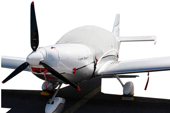
Sportcruiser Canopy Cover &amp; Plugs

Travel Covers are made with Silver Solution-Dyed Polyester fabric and only lined over the windshield to save weight. The material is lightweight and more compact for easy stowage in the aircraft. The polyester material is water resistant, but only intended for occasional use outside. We also have an ultra lightweight material available for fitted hangar dust covers. For daily outdoor use, the non-travel Sunbrella Cover is the best choice.