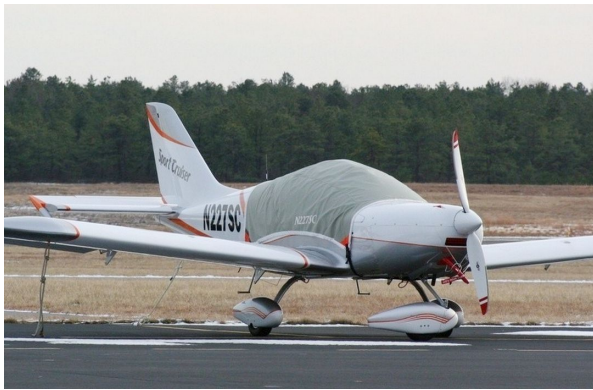
Czech Sport Cruiser Canopy Cover

This cover type is made from Silver Acrylic Sunbrella canvas and is 100% lined with a soft and smooth microfiber. Bruce's Custom Covers developed this material combination especially for aircraft protection. The outer material is medium weight and treated for water resistance, UV resistance and anti-static buildup. The inner lining is a very soft and smooth microfiber to prevent scratching. The material is very reflective, and tests show that the cabin interior temperature can be reduced to near-ambient temperature on the hottest of days. It is water, ice and snow repellent, yet breathable to allow moisture to escape from between the cover and the aircraft surface.