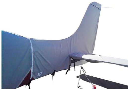
Cirrus SR20 Empennage Cover (covers tail boom, vertical and horizontal stabilizers)

WINTER USE MATERIAL - Made with Solution-Dyed Polyester fabric, this option is intended for seasonal use to aid in deicing, rain mitigation, or for occasional travel. The material is lighter and more compact, but more susceptible to UV damage and may have a shorter useful life if used continuously outside than the all-year use material.