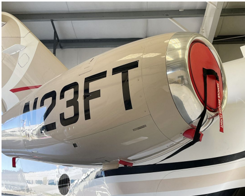
Hawker Beechcraft Premier 390 Intake Plug/Exhaust Plug Set

The Hawker Beechcraft Premier 390 Intake/Exhaust Plugs are custom fit for the intake and exhaust openings, made with heavy-duty vinyl material, and stuffed with a single block of sculpted urethane foam. Each plug has a zipper that allows the foam to be removed and dried if necessary. Engine plugs have 'remove before flight' streamers sewn onto the face of the plugs. Most plugs are imprinted with the aircraft registration number in black. Engine plugs may be inserted after flight when the engine is still warm. Engine Inlet Plugs are commonly referred to as Cowl Plugs, Intake Plugs, Cowl Blocks, Engine Blocks, and Engine Bungs.