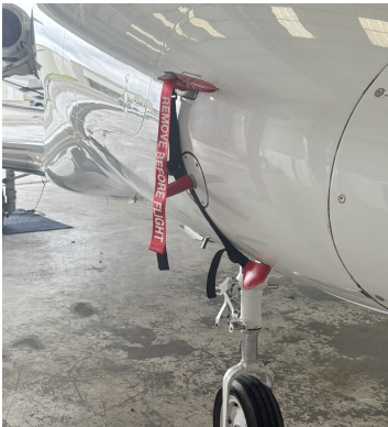
Hawker Beechcraft Premier Pitot, AOA, Icing Cover Set