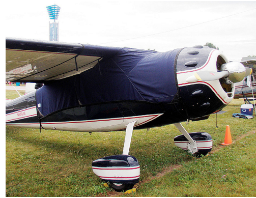
Cessna 195 Canopy Cover, extended forward and over gas caps Cessna 195 Canopy Cover, extended forward and over gas caps