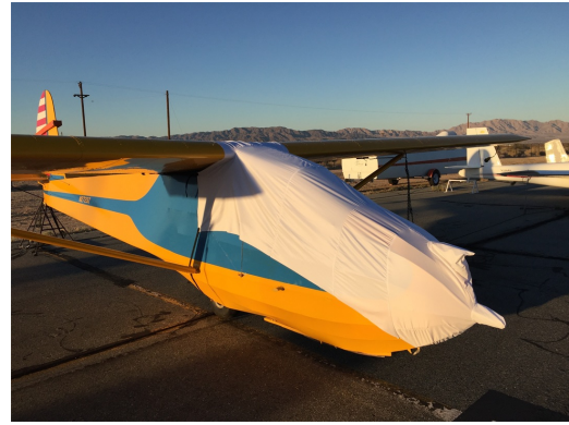
Schweizer SGU 2-22EK Canopy/Nose Cover, test fit cover