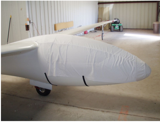
Bolkow Phoebus C-1 Canopy/Nose Cover, test fit cover

the hottest of days. It is water, ice and snow repellent, yet breathable to allow moisture to escape from between the cover and the aircraft surface.