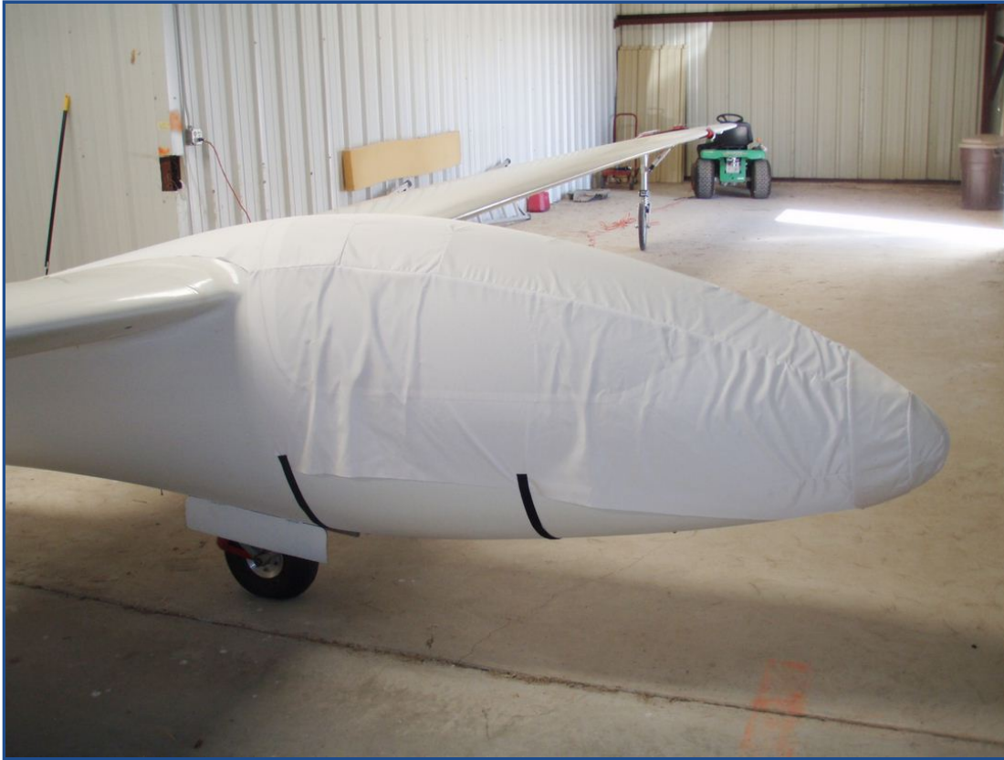
Bolkow Phoebus C-1 Canopy/Nose Cover, test fit cover