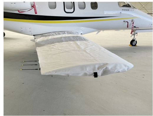
Embraer Phenom 100 Canopy/Nose Cover