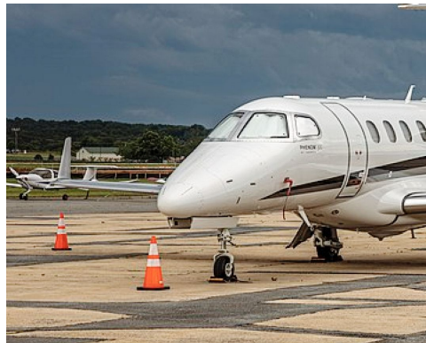
Embraer Phenom 100 Cockpit HeatShields

Cockpit Heatshields are interior sunshades for the aircraft's cockpit. The product is a unique composite of closed-cell foam with a silver mylar finish. The semi-rigid design is stiff enough to stand inside the window framing. The set folds up flat and is easily stored in the included storage sleeve. Some designs may require velcro and suction cups. Our Heatshields for jets are offered white side out because some aircraft manufacturers have issued advisories against reflective window inserts due to potential heat damage. A Heatshield is an excellent short-term remedy for cockpit overheating, but an external fabric cover is more effective for long-term protection.