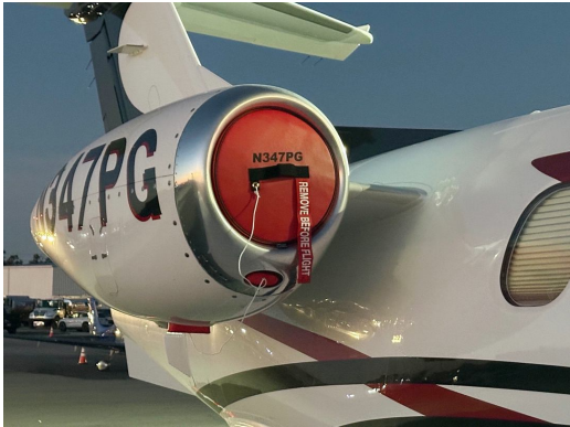
Embraer Phenom 100 Intake & Exhaust Plugs