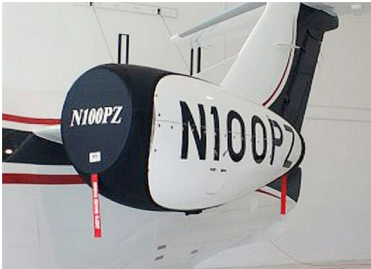
Phenom 100 "Bikini" Engine Covers