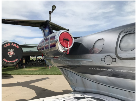
Embraer Phenom I Engine Inlet Plugs

The Engine Inlet Plugs are custom fit for your Embraer Phenom 100 (EMB-500) intakes, made with heavy-duty vinyl material, and stuffed with a single block of sculpted urethane foam. Each plug has a zipper that allows the foam to be removed and dried if necessary. Engine plugs have 'remove before flight' streamers sewn onto the face of the plugs. Most plugs are imprinted with the aircraft registration number in black for an extra charge. Storage bag NOT included. Engine plugs may be inserted after flight when the engine is still warm. Engine Inlet Plugs are commonly referred to as Cowl Plugs, Intake Plugs, Cowl Blocks, Engine Blocks, and Engine Bungs.