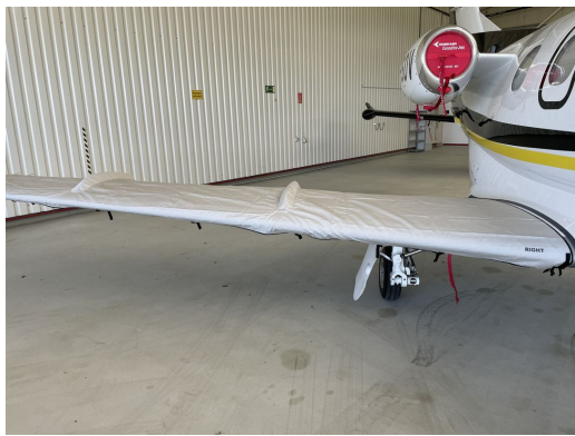
Embraer Phenom 100 Canopy/Nose Cover