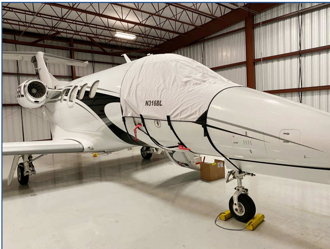
Embraer Phenom 100 Cockpit Cover