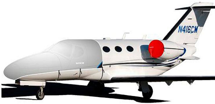
Citation Mustang 510 Cockpit/Door/Nose Cover, Engine Inlet Cover