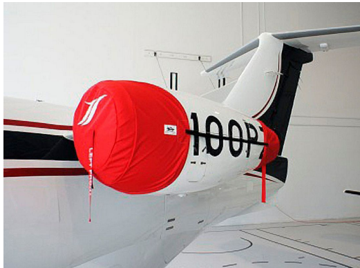
Phenom 100 Tri-fold style Engine Cover Set

Engine Inlet Plugs are commonly referred to as Cowl Plugs, Intake Plugs, Cowl Blocks, Engine Blocks, and Engine Bungs.