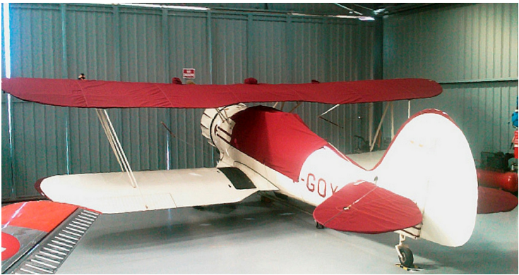
Waco UPF-7 Upper Wing Cover, Horizontal Stabilizer Cover & Canopy Cover

WINTER USE MATERIAL - Made with Solution-Dyed Polyester fabric, this option is intended for seasonal use to aid in deicing, rain mitigation, or for occasional travel. The material is lighter and more compact, but more susceptible to UV damage and may have a shorter useful life if used continuously outside than the all-year use material.