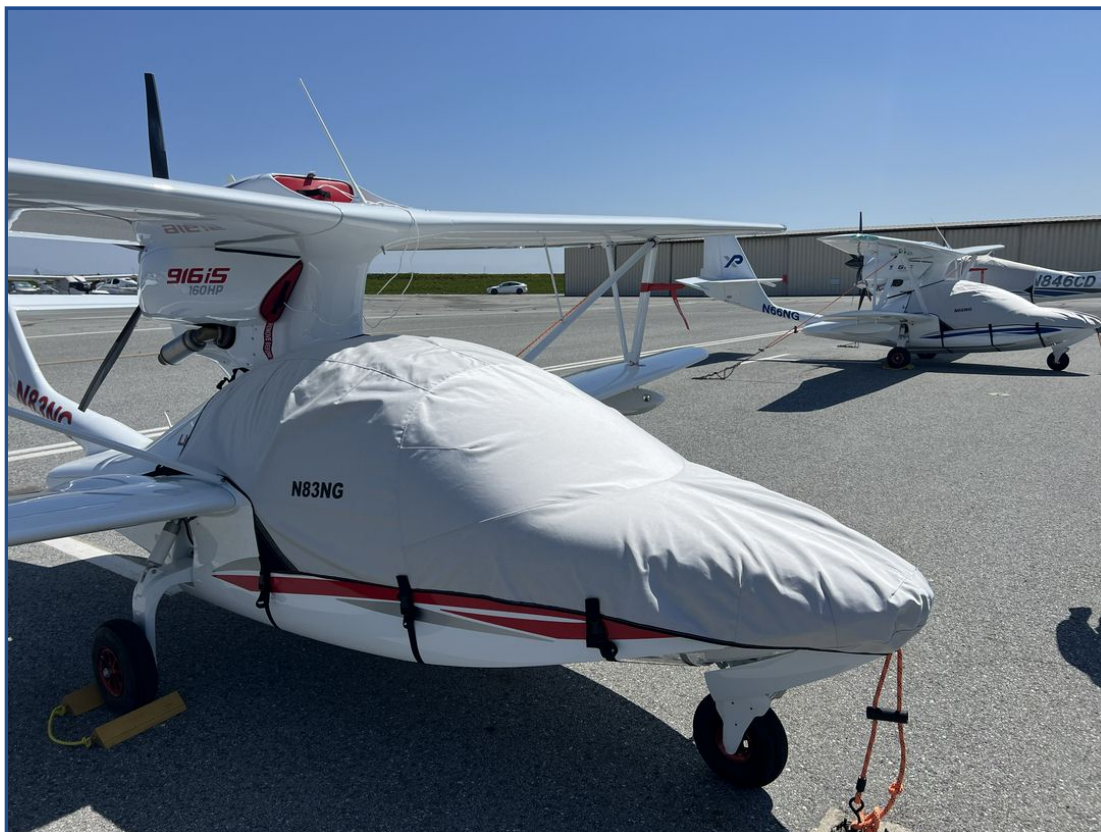
Scoda Aeronautica Super Petrel CanopyNose Cover; Engine Plugs