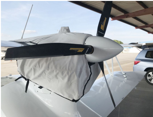
Scoda Aeronautica Super Petrel Engine Cover