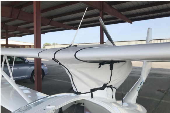
Scoda Aeronautica Super Petrel Engine Cover

Insulated Covers Material - A special composite material of solution-dyed polyester, 3M Thinsulate insulation, and soft nylon interior fabric. Our insulated covers are designed to complement an engine preheater and help retain heat in the engine compartment after shutdown. If you operate your aircraft in cold-weather, these covers will help prevent engine wear and tear.