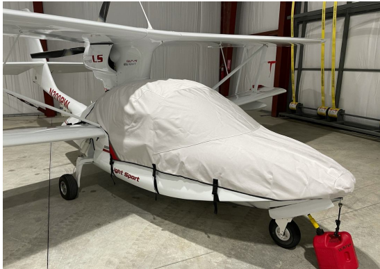
Scoda Super Petrel Canopy/Nose Cover