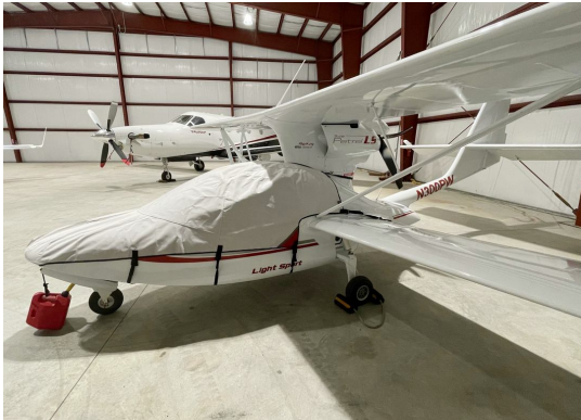
Scoda Super Petrel Canopy/Nose Cover

Travel Covers are made with Silver Solution-Dyed Polyester fabric and only lined over the windshield to save weight. The material is lightweight and more compact for easy stowage in the aircraft. The polyester material is water resistant, but only intended for occasional use outside. We also have an ultra lightweight material available for fitted hangar dust covers. For daily outdoor use, the non-travel Sunbrella Cover is the best choice.