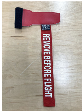
Pitot Tube Cover

Scoda Aeronautica Super Petrel Amphibian Pitot Tube Covers , NOT HEAT RESISTANT TYPE, are made of Naugahyde vinyl, and are designed to cover the entire pitot assembly. Slipping over the tube, the cover tightens around the base with a Velcro strap detail. A "Remove Before Flight" streamer is attached to the cover. Heat Resistant Pitot Covers are an upgrade to this design, and help prevent the pitot cover from melting onto the tube if the pitot heat is accidentally turned on while installed. If you want the set tethered together, please let us know.