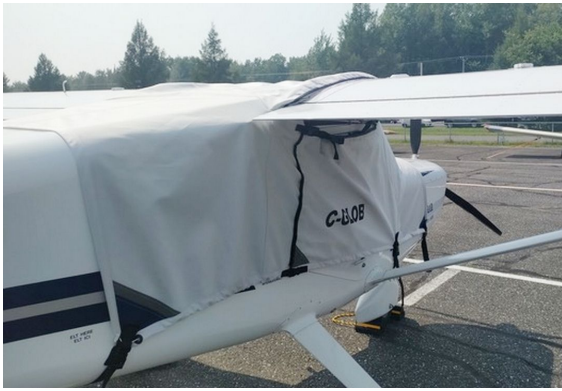
Ultravia Pelican Canopy Cover Over-Top type