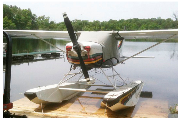
Glastar Sportsman Canopy Cover and Engine Plugs