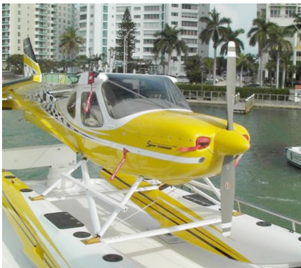
Glastar Engine Plugs

Engine Inlet Plugs are custom fit for your Ultravia Pelican intakes, made with heavy-duty vinyl material, and stuffed with a single block of sculpted urethane foam. Each plug has a zipper that allows the foam to be removed and dried if necessary. Engine plugs have warning flags that are visible from the cockpit or 'remove before flight' streamers sewn onto the face of the plugs. Most plugs are imprinted with the aircraft registration number in black for an extra charge. Storage bag NOT included. Engine plugs may be inserted after flight when the engine is still warm. Engine Inlet Plugs are commonly referred to as Cowl Plugs, Intake Plugs, Cowl Blocks, Engine Blocks, and Engine Bung.