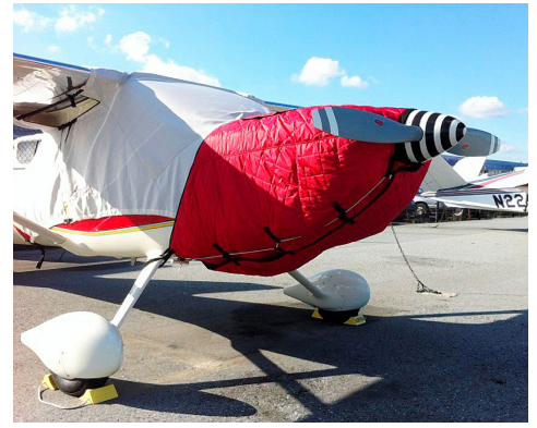
Glastar Insulated Engine Cover