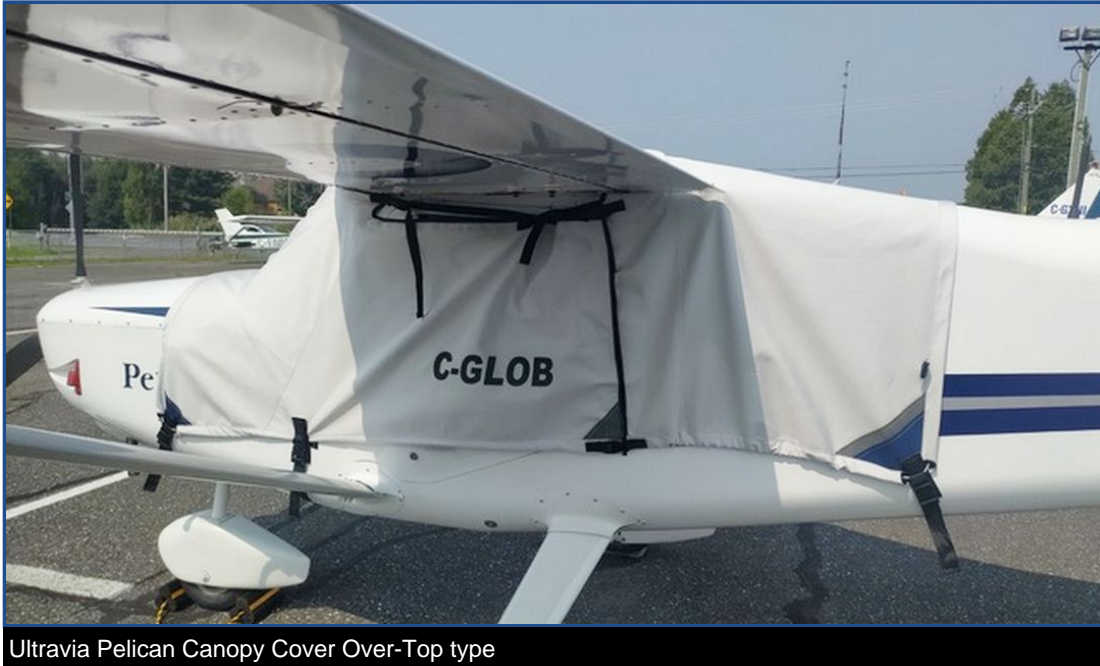
Ultravia Pelican Canopy Cover Over-Top type