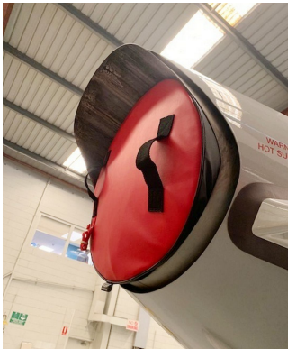
Pilatus PC-24 Engine Exhaust Plug

The Engine Inlet Plugs are custom fit for your Pilatus PC-24 intakes, made with heavy-duty vinyl material, and stuffed with a single block of sculpted urethane foam. Each plug has a zipper that allows the foam to be removed and dried if necessary. Engine plugs have 'remove before flight' streamers sewn onto the face of the plugs. Most plugs are imprinted with the aircraft registration number in black for an extra charge. Storage bag NOT included. Engine plugs may be inserted after flight when the engine is still warm. Engine Inlet Plugs are commonly referred to as Cowl Plugs, Intake Plugs, Cowl Blocks, Engine Blocks, and Engine Bungs.