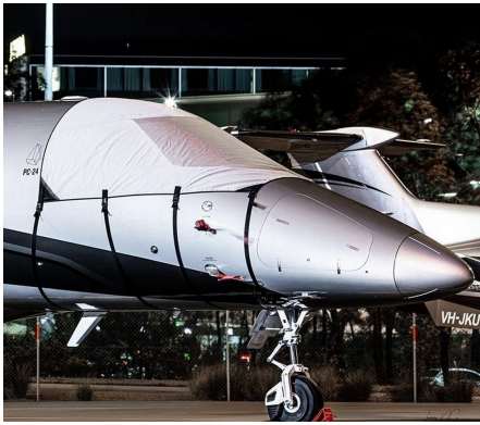
Pilatus PC-24 Cockpit Cover