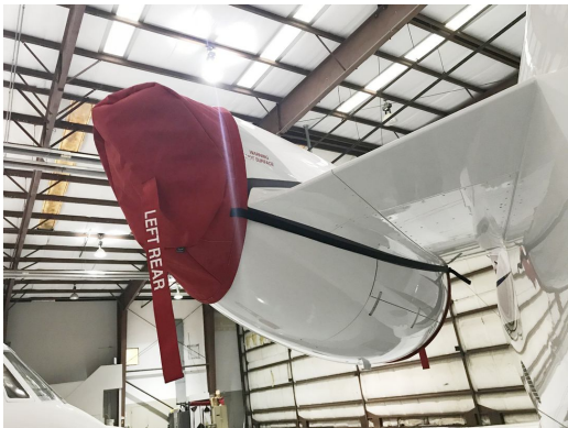
Pilatus PC-24 Engine Cover Set, Tri-Fold Type