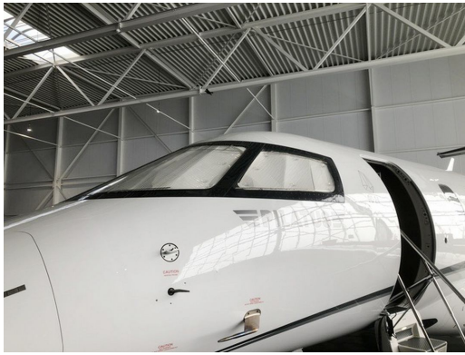
Pilatus PC-24 Cockpit HeatShields