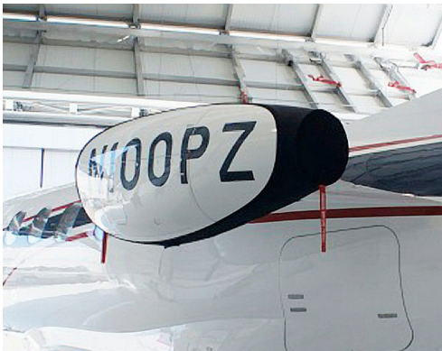
Phenom 100 "Bikini" Engine Covers

The Pilatus PC-24 Intake/Exhaust Plugs are custom fit for the intake and exhaust openings, made with heavy-duty vinyl material, and stuffed with a single block of sculpted urethane foam. Each plug has a zipper that allows the foam to be removed and dried if necessary. Engine plugs have 'remove before flight' streamers sewn onto the face of the plugs. Most plugs are imprinted with the aircraft registration number in black. Engine plugs may be inserted after flight when the engine is still warm. Engine Inlet Plugs are commonly referred to as Cowl Plugs, Intake Plugs, Cowl Blocks, Engine Blocks, and Engine Bungs.