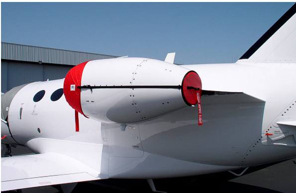
Citation Mustang Intake Cover/Exhaust Plug Set

The Pilatus PC-24 Intake/Exhaust Plugs are custom fit for the intake and exhaust openings, made with heavy-duty vinyl material, and stuffed with a single block of sculpted urethane foam. Each plug has a zipper that allows the foam to be removed and dried if necessary. Engine plugs have 'remove before flight' streamers sewn onto the face of the plugs. Most plugs are imprinted with the aircraft registration number in black. Engine plugs may be inserted after flight when the engine is still warm. Engine Inlet Plugs are commonly referred to as Cowl Plugs, Intake Plugs, Cowl Blocks, Engine Blocks, and Engine Bungs.