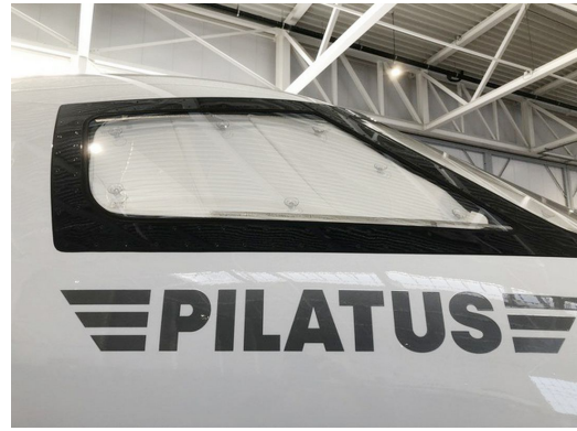
Pilatus PC-24 Cockpit HeatShields