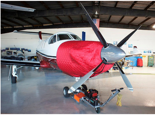
Pilatus PC-12 Insulated Engine Cover