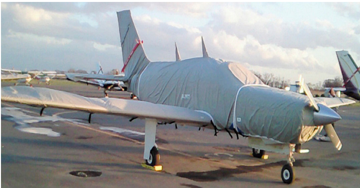
Piper PA-46 Malibu Complete Cover Set