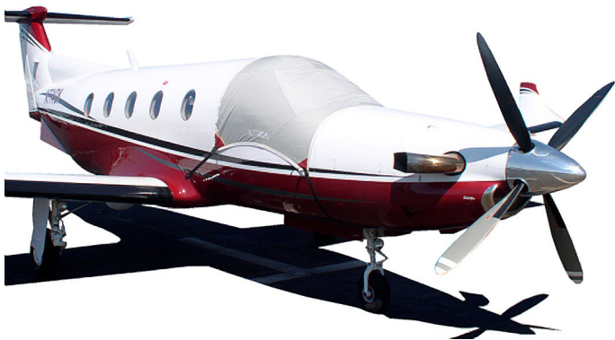
PC-12 Windshield Cover

This cover type is made from Silver Acrylic Sunbrella canvas and is 100% lined with a soft and smooth microfiber. Bruce's Custom Covers developed this material combination especially for aircraft protection. The outer material is medium weight and treated for water resistance, UV resistance and anti-static buildup. The inner lining is a very soft and smooth microfiber to prevent scratching. The material is very reflective, and tests show that the cabin interior temperature can be reduced to near-ambient temperature on the hottest of days. It is water, ice and snow repellent, yet breathable to allow moisture to escape from between the cover and the aircraft surface.