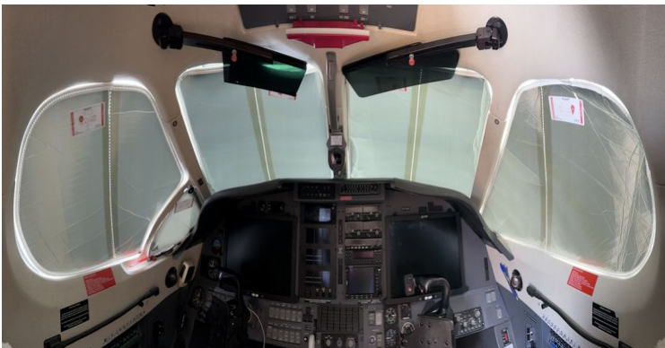
Pilatus PC-12 Engine Plugs, Prop Tie/Exhaust Covers, Cockpit HeatShields