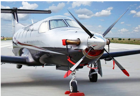
Pilatus PC-12 Engine Plugs, Prop Ties, Cockpit HeatShields