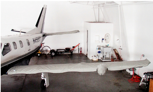
Socata TBM 700, 850 Wing and Horizontal Stabilizer Covers

WINTER USE MATERIAL - Made with Solution-Dyed Polyester fabric, this option is intended for seasonal use to aid in deicing, rain mitigation, or for occasional travel. The material is lighter and more compact, but more susceptible to UV damage and may have a shorter useful life if used continuously outside than the all-year use material.