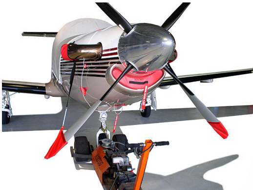
Pilatus PC-12 LARGE ENGINE INLET PLUG, SMALL PLUGS SET, Prop Tie/Exhaust Covers

Engine Inlet Plugs are custom fit for your Pilatus PC-12, U-28A, NGX intakes, made with heavy-duty vinyl material, and stuffed with a single block of sculpted urethane foam. Each plug has a zipper that allows the foam to be removed and dried if necessary. Engine plugs have warning flags that are visible from the cockpit or 'remove before flight' streamers sewn onto the face of the plugs. Most plugs are imprinted with the aircraft registration number in black for an extra charge. Storage bag NOT included. Engine plugs may be inserted after flight when the engine is still warm. Engine Inlet Plugs are commonly referred to as Cowl Plugs, Intake Plugs, Cowl Blocks, Engine Blocks, and Engine Bungs.