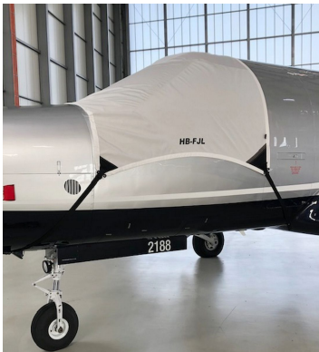
Pilatus PC-12 Cockpit Cover