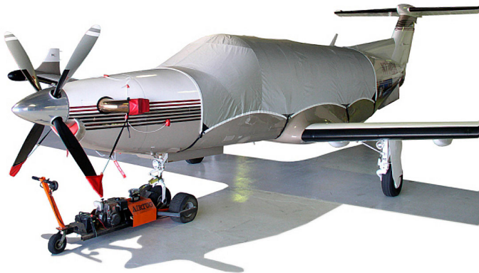
Main Intake Plug and Prop-Tie/Exhaust Covers. (Sold Separately) PC-12 Canopy Cover, Engine Plugs, Prop Tie/Exhaust Covers