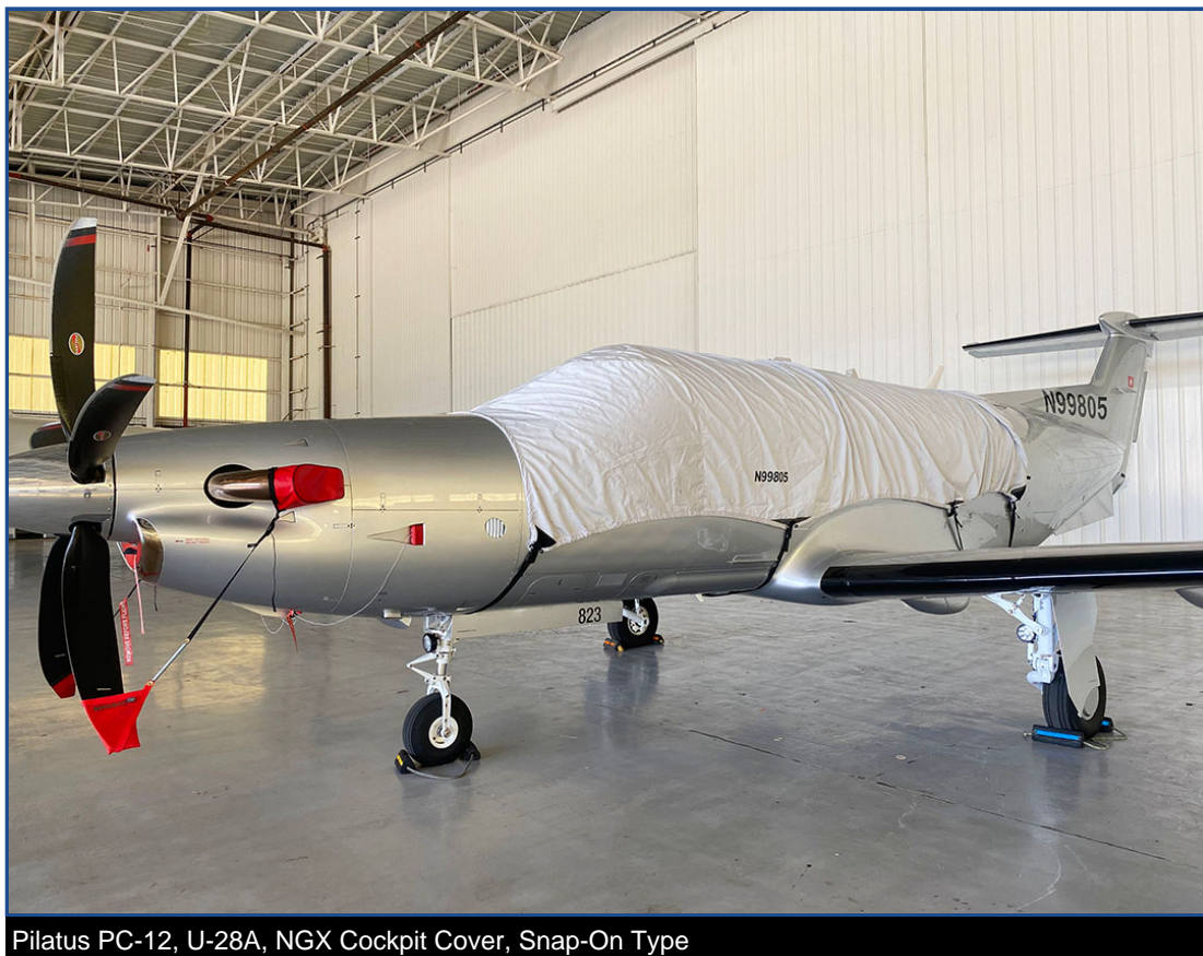
Pilatus PC-12, U-28A, NGX Cockpit Cover, Snap-On Type