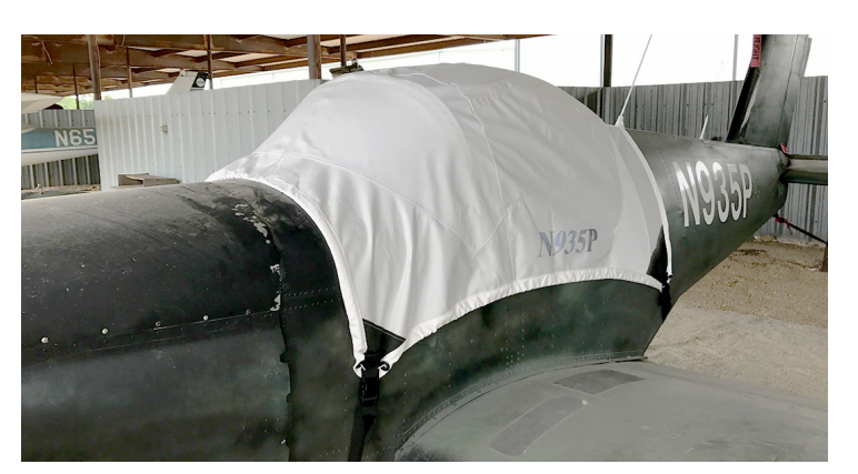
Pazmany PL2 Homebuilt Canopy Cover