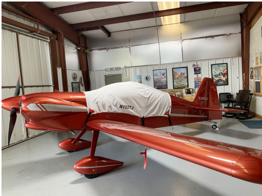
SPA Sport Panther Canopy Cover

This cover type is made from Silver Acrylic Sunbrella canvas and is 100% lined with a soft and smooth microfiber. Bruce's Custom Covers developed this material combination especially for aircraft protection. The outer material is medium weight and treated for water resistance, UV resistance and anti-static buildup. The inner lining is a very soft and smooth microfiber to prevent scratching. The material is very reflective, and tests show that the cabin interior temperature can be reduced to near-ambient temperature on the hottest of days. It is water, ice and snow repellent, yet breathable to allow moisture to escape from between the cover and the aircraft surface.