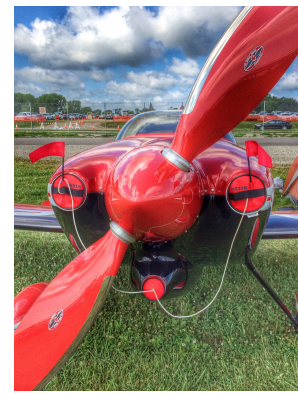
SPA Sport Panther Engine Plugs