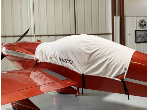
SPA Sport Panther Canopy Cover

This cover type is made from Silver Acrylic Sunbrella canvas and is 100% lined with a soft and smooth microfiber. Bruce's Custom Covers developed this material combination especially for aircraft protection. The outer material is medium weight and treated for water resistance, UV resistance and anti-static buildup. The inner lining is a very soft and smooth microfiber to prevent scratching. The material is very reflective, and tests show that the cabin interior temperature can be reduced to near-ambient temperature on the hottest of days. It is water, ice and snow repellent, yet breathable to allow moisture to escape from between the cover and the aircraft surface.