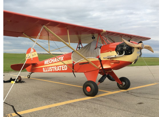
Corben Baby Ace Cockpit Cover