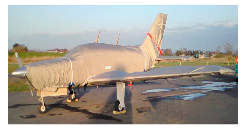
Piper Mirage, Melibu, JetProp, Meridian Tailcone Cover