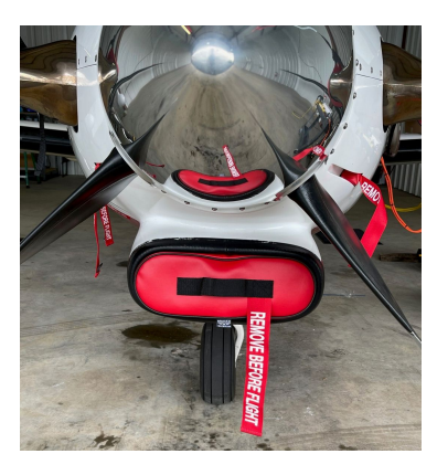
Piper Malibu JetProp Inlet Plugs

This cover type is made from Silver Acrylic Sunbrella canvas and is 100% lined with a soft and smooth microfiber. Bruce's Custom Covers developed this material combination especially for aircraft protection. The outer material is medium weight and treated for water resistance, UV resistance and anti-static buildup. The inner lining is a very soft and smooth microfiber to prevent scratching. The material is very reflective, and tests show that the cabin interior temperature can be reduced to near-ambient temperature on the hottest of days. It is water, ice and snow repellent, yet breathable to allow moisture to escape from between the cover and the aircraft surface.