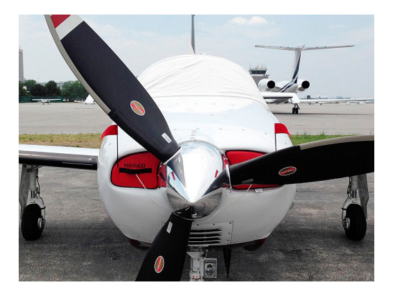
Piper Mirage Engine Plugs

Engine Inlet Plugs are custom fit for your Piper PA-46 Malibu intakes, made with heavy-duty vinyl material, and stuffed with a single block of sculpted urethane foam. Each plug has a zipper that allows the foam to be removed and dried if necessary. Engine plugs have warning flags that are visible from the cockpit or 'remove before flight' streamers sewn onto the face of the plugs. Most plugs are imprinted with the aircraft registration number in black for an extra charge. Storage bag NOT included. Engine plugs may be inserted after flight when the engine is still warm. Engine Inlet Plugs are commonly referred to as Cowl Plugs, Intake Plugs, Cowl Blocks, Engine Blocks, and Engine Bungs.