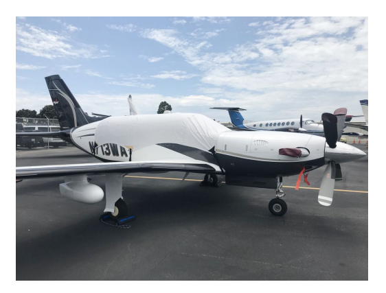
Piper Meridian Canopy Cover