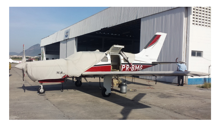
Piper Malibu/Mirage Extended Canopy Cover, Engine, Prop & Wing Covers

This cover type is made from Silver Acrylic Sunbrella canvas and is 100% lined with a soft and smooth microfiber. Bruce's Custom Covers developed this material combination especially for aircraft protection. The outer material is medium weight and treated for water resistance, UV resistance and anti-static buildup. The inner lining is a very soft and smooth microfiber to prevent scratching. The material is very reflective, and tests show that the cabin interior temperature can be reduced to near-ambient temperature on the hottest of days. It is water, ice and snow repellent, yet breathable to allow moisture to escape from between the cover and the aircraft surface.