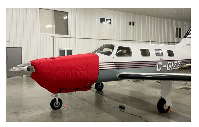
Malibu PA-46-310P Insulated Engine Cover