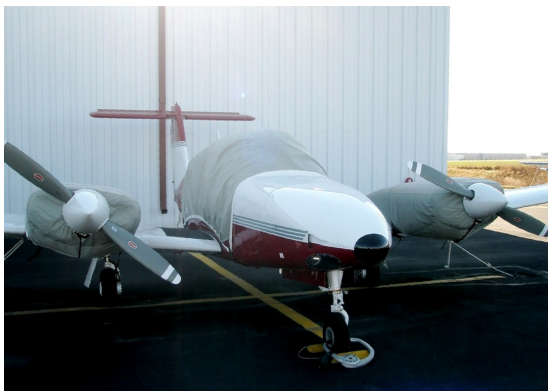
Piper Seminole Canopy and Engine Covers