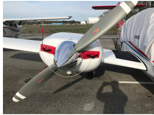
Piper Seminole Engine Plugs