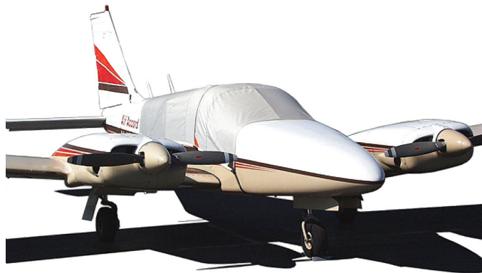
Piper Seneca PA-34 Canopy Cover

Travel Covers are made with Silver Solution-Dyed Polyester fabric and only lined over the windshield to save weight. The material is lightweight and more compact for easy stowage in the aircraft. The polyester material is water resistant, but only intended for occasional use outside. We also have an ultra lightweight material available for fitted hangar dust covers. For daily outdoor use, the non-travel Sunbrella Cover is the best choice.