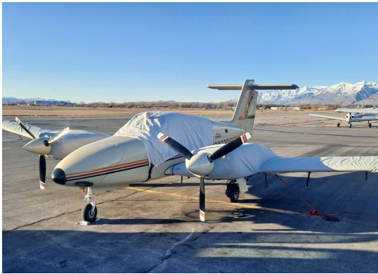
Piper PA-44 Wing/Engine Covers, Canopy Cover

WINTER USE MATERIAL - Made with Solution-Dyed Polyester fabric, this option is intended for seasonal use to aid in deicing, rain mitigation, or for occasional travel. The material is lighter and more compact, but more susceptible to UV damage and may have a shorter useful life if used continuously outside than the all-year use material.