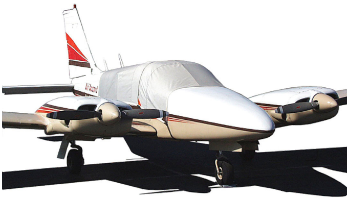
Piper Seneca PA-34 Canopy Cover