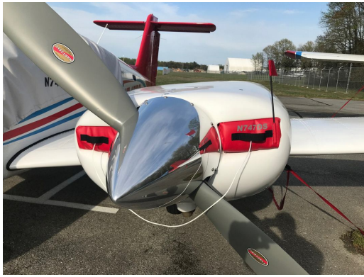
Piper Seminole Engine Plugs