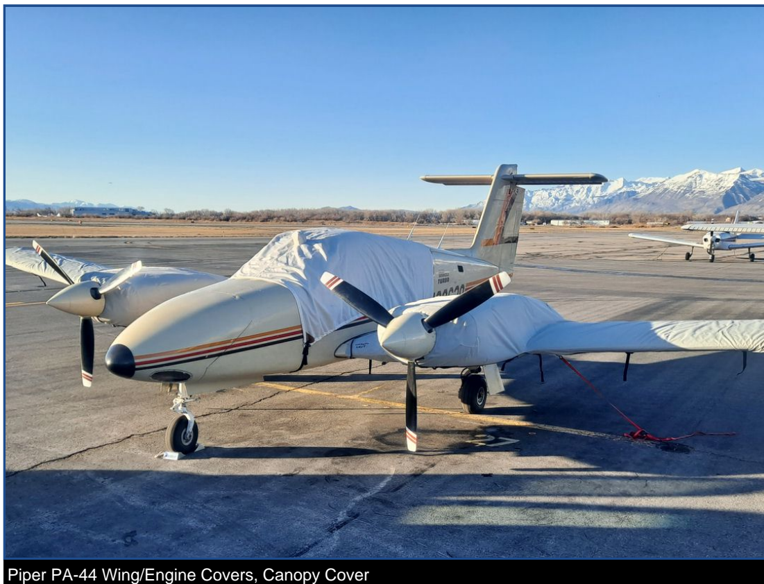
Piper PA-44 Wing/Engine Covers, Canopy Cover