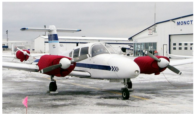
Piper Seminole Insulated Engine Covers