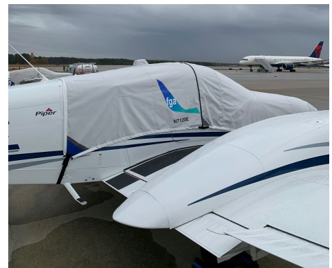
Piper PA-44 Seminole Canopy/Nose Cover