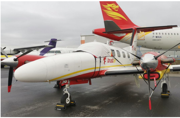
Piper PA-42 Cheyenne III Cockpit Cover, Prop Tie/Exhaust Cover, Inlet Plugs