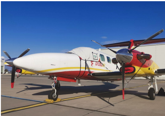
Piper PA-42 Cheyenne III Engine Plugs, Prop Ties, Cockpit Cover