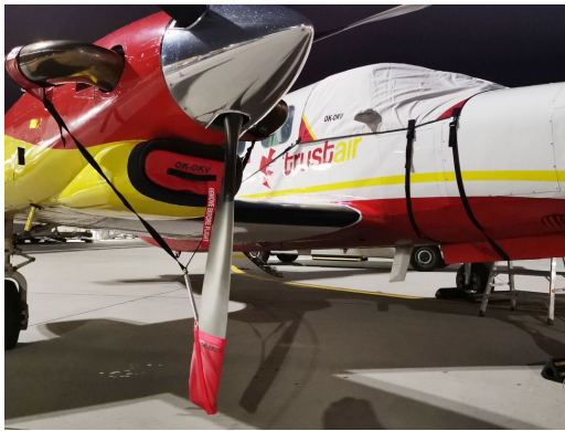
Piper PA-42 Cheyenne III Cockpit Cover, Prop Tie/Exhaust Cover, Inlet Plugs

This cover type is made from Silver Acrylic Sunbrella canvas and is 100% lined with a soft and smooth microfiber. Bruce's Custom Covers developed this material combination especially for aircraft protection. The outer material is medium weight and treated for water resistance, UV resistance and anti-static buildup. The inner lining is a very soft and smooth microfiber to prevent scratching. The material is very reflective, and tests show that the cabin interior temperature can be reduced to near-ambient temperature on the hottest of days. It is water, ice and snow repellent, yet breathable to allow moisture to escape from between the cover and the aircraft surface.