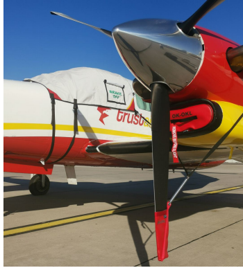
Piper PA-42 Cheyenne III Engine Plugs, Prop Ties, Cockpit Cover

Engine Inlet Plugs are custom fit for your Piper PA-42 Cheyenne III intakes, made with heavy-duty vinyl material, and stuffed with a single block of sculpted urethane foam. Each plug has a zipper that allows the foam to be removed and dried if necessary. Engine plugs have warning flags that are visible from the cockpit or 'remove before flight' streamers sewn onto the face of the plugs. Most plugs are imprinted with the aircraft registration number in black for an extra charge. Storage bag NOT included. Engine plugs may be inserted after flight when the engine is still warm. Engine Inlet Plugs are commonly referred to as Cowl Plugs, Intake Plugs, Cowl Blocks, Engine Blocks, and Engine Bungs.