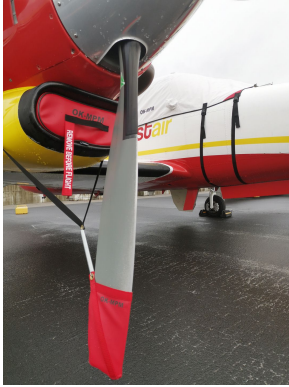
Piper PA-42 Cheyenne III Prop Tie/Exhaust Cover, Inlet Plugs

Engine Inlet Plugs are custom fit for your Piper PA-42 Cheyenne III intakes, made with heavy-duty vinyl material, and stuffed with a single block of sculpted urethane foam. Each plug has a zipper that allows the foam to be removed and dried if necessary. Engine plugs have warning flags that are visible from the cockpit or 'remove before flight' streamers sewn onto the face of the plugs. Most plugs are imprinted with the aircraft registration number in black for an extra charge. Storage bag NOT included. Engine plugs may be inserted after flight when the engine is still warm. Engine Inlet Plugs are commonly referred to as Cowl Plugs, Intake Plugs, Cowl Blocks, Engine Blocks, and Engine Bungs.