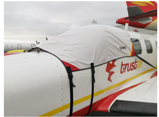
Piper PA-42 Cheyenne III Cockpit Cover