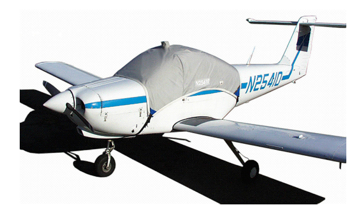
Piper Tomahawk Canopy Cover

Travel Covers are made with Silver Solution-Dyed Polyester fabric and only lined over the windshield to save weight. The material is lightweight and more compact for easy stowage in the aircraft. The polyester material is water resistant, but only intended for occasional use outside. We also have an ultra lightweight material available for fitted hangar dust covers. For daily outdoor use, the non-travel Sunbrella Cover is the best choice.