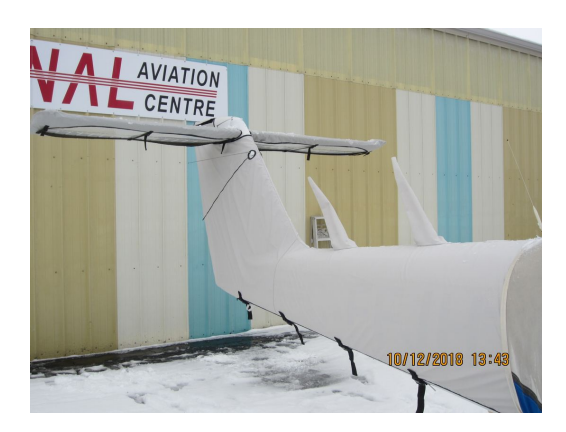
Piper PA-38 Tomahawk Empennage Cover (Tailboom, Vertical & Horiz Stabilizers) Set (W/Horiz. Stab. Cover), Winter Use

WINTER USE MATERIAL - Made with Solution-Dyed Polyester fabric, this option is intended for seasonal use to aid in deicing, rain mitigation, or for occasional travel. The material is lighter and more compact, but more susceptible to UV damage and may have a shorter useful life if used continuously outside than the all-year use material.