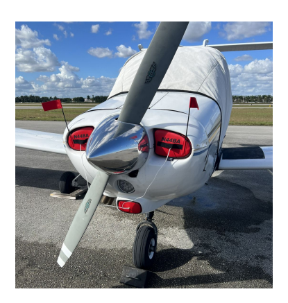
PA-38 Tomahawk Engine Inlet Plugs, Includes Carb. Inlet Plug Set of 3)