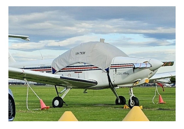
Piper PA-38 Tomahawk Canopy Cover