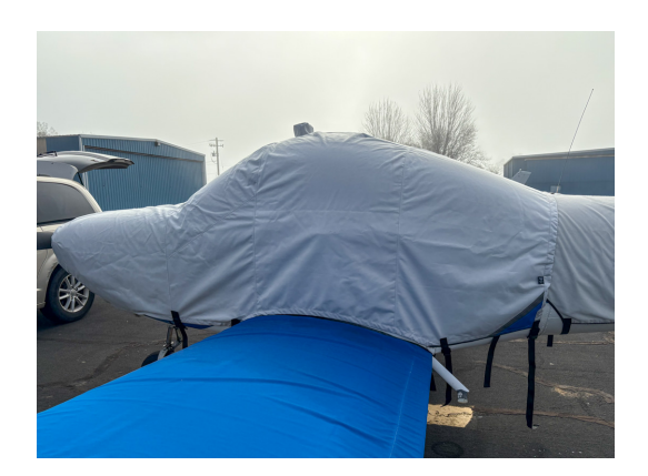
Piper PA-38 Tomahawk Extended Canopy/Engine Cover

This cover type is made from Silver Acrylic Sunbrella canvas and is 100% lined with a soft and smooth microfiber. Bruce's Custom Covers developed this material combination especially for aircraft protection. The outer material is medium weight and treated for water resistance, UV resistance and anti-static buildup. The inner lining is a very soft and smooth microfiber to prevent scratching. The material is very reflective, and tests show that the cabin interior temperature can be reduced to near-ambient temperature on the hottest of days. It is water, ice and snow repellent, yet breathable to allow moisture to escape from between the cover and the aircraft surface.