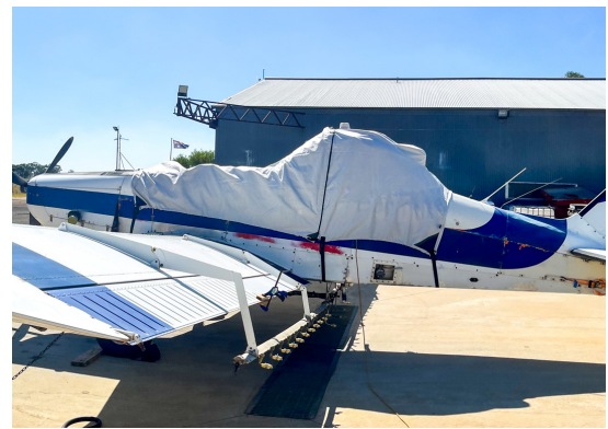
Brave PA-36 Canopy/Hopper Cover