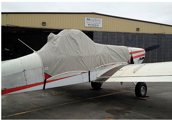
Piper Brave PA-36 Canopy/Hopper Cover