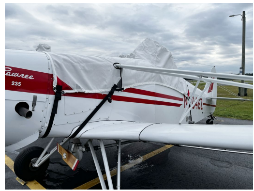
Piper Pawnee PA25 Canopy/Hopper Cover