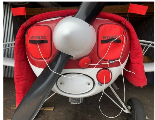
Piper PA-25 Pawnee Engine Plugs