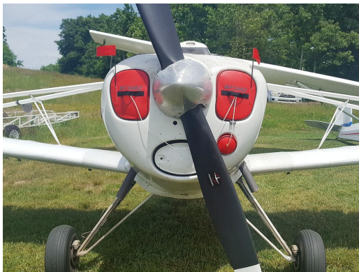
Piper Pa-25-235 Engine Inlet Plugs

Engine Inlet Plugs are custom fit for your Piper Pawnee PA-25 intakes, made with heavy-duty vinyl material, and stuffed with a single block of sculpted urethane foam. Each plug has a zipper that allows the foam to be removed and dried if necessary. Engine plugs have warning flags that are visible from the cockpit or 'remove before flight' streamers sewn onto the face of the plugs. Most plugs are imprinted with the aircraft registration number in black for an extra charge. Storage bag NOT included. Engine plugs may be inserted after flight when the engine is still warm. Engine Inlet Plugs are commonly referred to as Cowl Plugs, Intake Plugs, Cowl Blocks, Engine Blocks, and Engine Bungs.