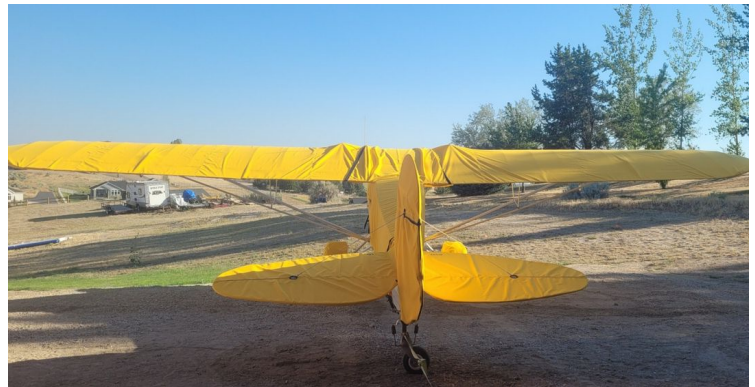
Piper PA-18 All Weather Cover Set