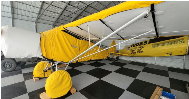
Piper PA-18 Complete Cover Set

ALL-YEAR USE MATERIAL - Made with Silver Acrylic Sunbrella canvas, the all-year use material is the best option for sun protection and cover longevity. This heavier more durable material is intended for all weather conditions, such as rain and snow or lots of sun.