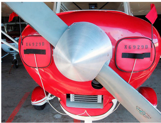
Piper PA-22-150 Engine Inlet Plugs (set of 3)