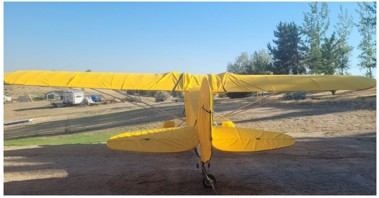
Piper PA-18 All Weather Cover Set