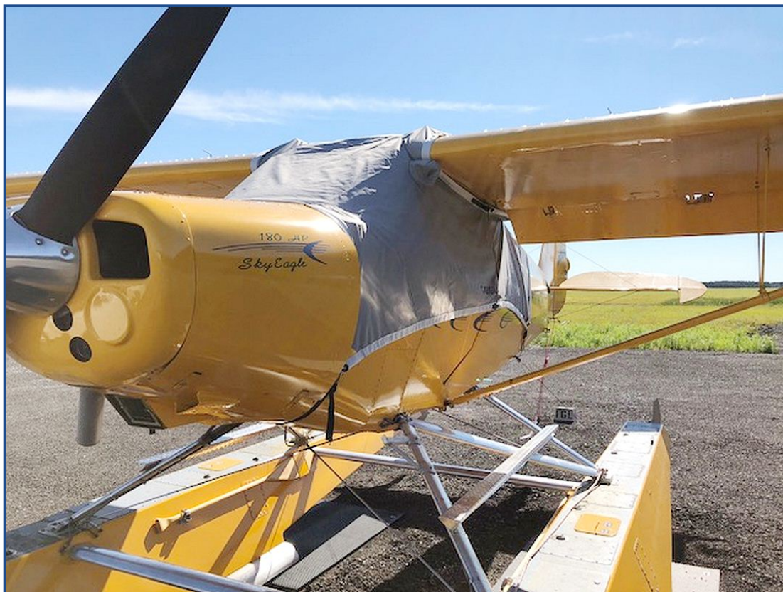
Sportsman 2+2 Wag Aero Light Weight Over the Top Travel Canopy Cover