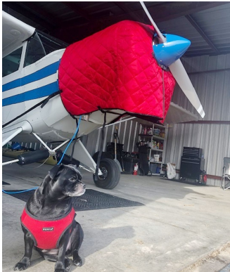
Piper PA-12 Insulated Hangar Blanket

This cover type is made from Silver Acrylic Sunbrella canvas and is 100% lined with a soft and smooth microfiber. Bruce's Custom Covers developed this material combination especially for aircraft protection. The outer material is medium weight and treated for water resistance, UV resistance and anti-static buildup. The inner lining is a very soft and smooth microfiber to prevent scratching. The material is very reflective, and tests show that the cabin interior temperature can be reduced to near-ambient temperature on the hottest of days. It is water, ice and snow repellent, yet breathable to allow moisture to escape from between the cover and the aircraft surface.