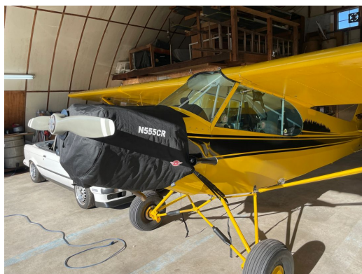
Piper PA-11 Replica Insulated Engine Cover

This cover type is made from Silver Acrylic Sunbrella canvas and is 100% lined with a soft and smooth microfiber. Bruce's Custom Covers developed this material combination especially for aircraft protection. The outer material is medium weight and treated for water resistance, UV resistance and anti-static buildup. The inner lining is a very soft and smooth microfiber to prevent scratching. The material is very reflective, and tests show that the cabin interior temperature can be reduced to near-ambient temperature on the hottest of days. It is water, ice and snow repellent, yet breathable to allow moisture to escape from between the cover and the aircraft surface.