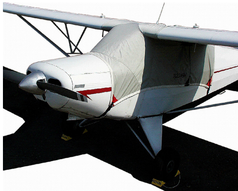
Piper PA-12 Super Cruiser Over-Top Canopy Cover

This cover type is made from Silver Acrylic Sunbrella canvas and is 100% lined with a soft and smooth microfiber. Bruce's Custom Covers developed this material combination especially for aircraft protection. The outer material is medium weight and treated for water resistance, UV resistance and anti-static buildup. The inner lining is a very soft and smooth microfiber to prevent scratching. The material is very reflective, and tests show that the cabin interior temperature can be reduced to near-ambient temperature on the hottest of days. It is water, ice and snow repellent, yet breathable to allow moisture to escape from between the cover and the aircraft surface.