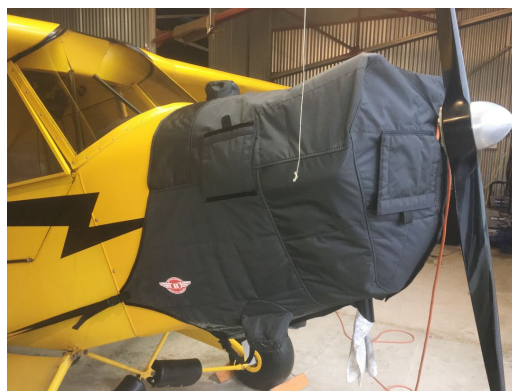
Piper J3 Cub Insulated Engine Cover