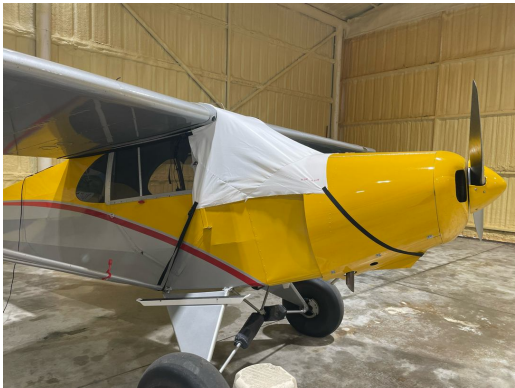
Piper J5A Windshield/Skylight Cover, test fit