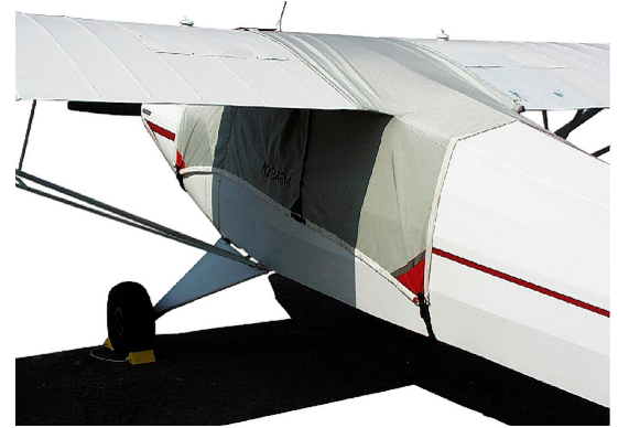
Sportsman 2+2 Wag Aero Light Weight Over the Top Travel Canopy Cover Piper PA-12 Super Cruiser Over-Top Canopy Cover