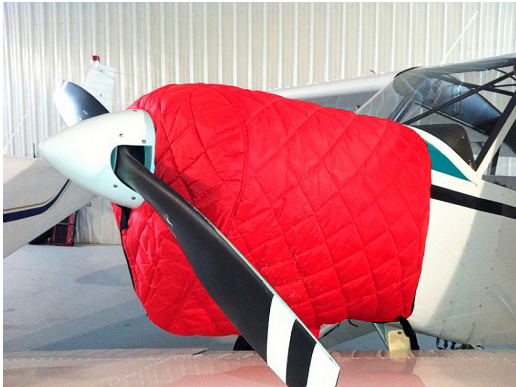
Piper Super Cub Insulated Engine Cover