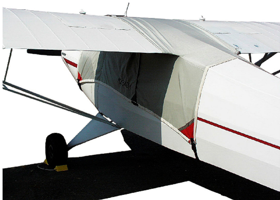
Piper PA-12 Super Cruiser Over-Top Canopy Cover