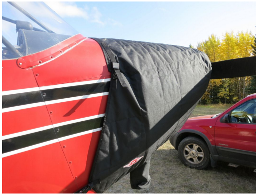
Piper PA-12 Insulated Engine Cover