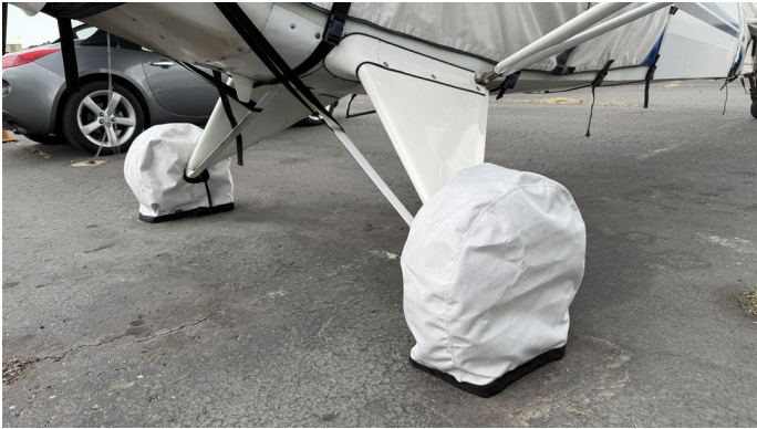
Piper PA-12: Super Cruiser, J5 Cub Tire Covers (No Wheelpant Faring) (Specify Tire Size)

ALL-YEAR USE MATERIAL - Made with Silver Acrylic Sunbrella canvas, the all-year use material is the best option for sun protection and cover longevity. This heavier more durable material is intended for all weather conditions, such as rain and snow or lots of sun.