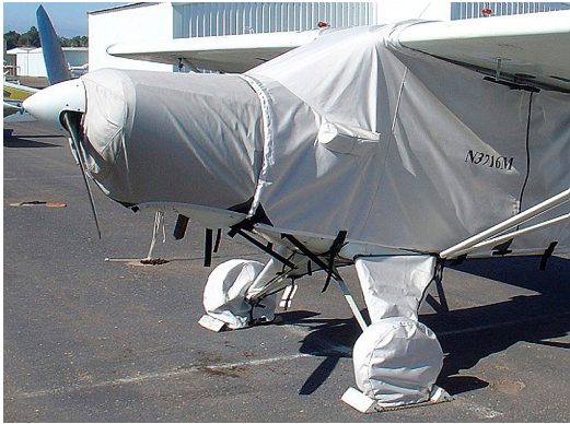
Piper PA-12 Landing Gear Covers