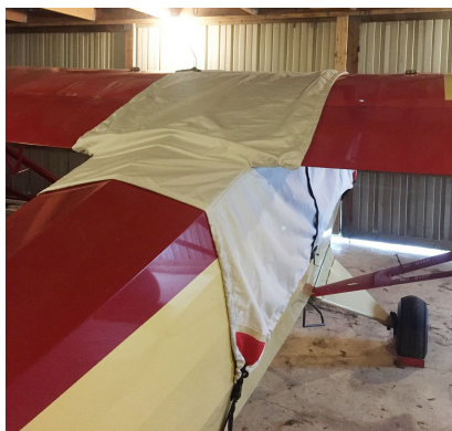
Piper PA-12 Over The Top Style Canopy Cover

This cover type is made from Silver Acrylic Sunbrella canvas and is 100% lined with a soft and smooth microfiber. Bruce's Custom Covers developed this material combination especially for aircraft protection. The outer material is medium weight and treated for water resistance, UV resistance and anti-static buildup. The inner lining is a very soft and smooth microfiber to prevent scratching. The material is very reflective, and tests show that the cabin interior temperature can be reduced to near-ambient temperature on the hottest of days. It is water, ice and snow repellent, yet breathable to allow moisture to escape from between the cover and the aircraft surface.