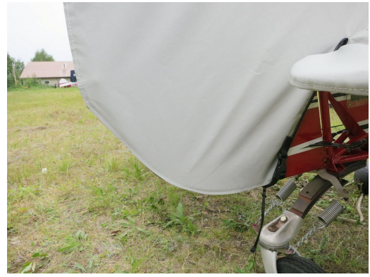
Piper PA-12 Abbreviated Empennage Cover