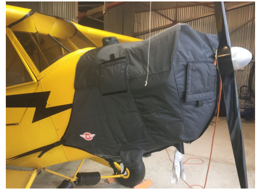
Piper J3 Cub Insulated Engine Cover