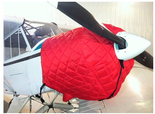
Piper Super Cub Insulated Engine Cover