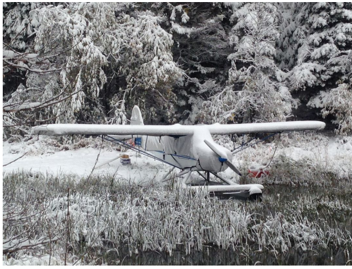
Piper PA-11 Cover Set