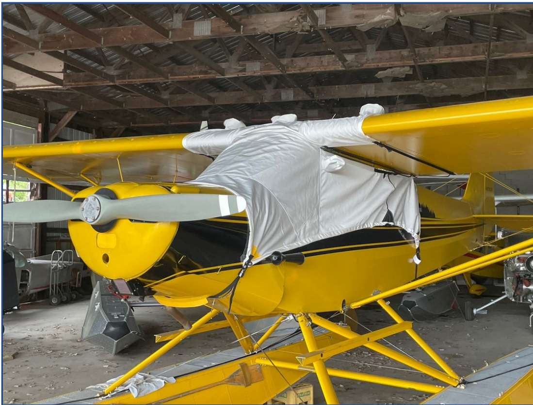
Piper PA-11 Over-Top Canopy Cover, extends to cover gas caps