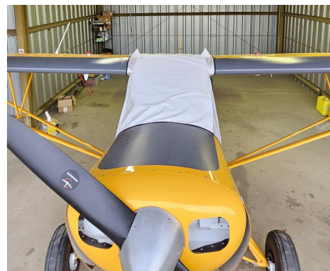
Piper PA-12: Super Cruiser, J5 Cub Windshield/Skylight Cover