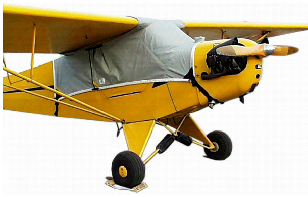
Piper J3 Canopy Cover