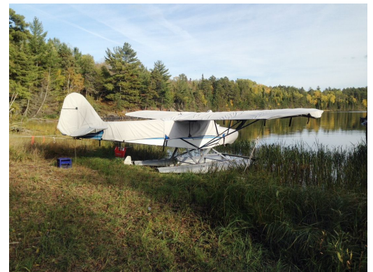
Piper PA-11 Cover Set