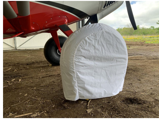
Cub Crafters CC19 Oversize Tire Covers, test fit cover