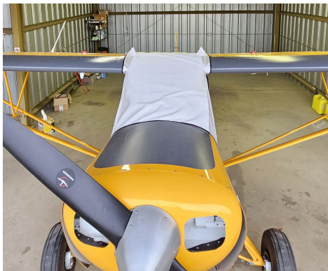
Piper PA-12: Super Cruiser, J5 Cub Windshield/Skylight Cover

This cover type is made from Silver Acrylic Sunbrella canvas and is 100% lined with a soft and smooth microfiber. Bruce's Custom Covers developed this material combination especially for aircraft protection. The outer material is medium weight and treated for water resistance, UV resistance and anti-static buildup. The inner lining is a very soft and smooth microfiber to prevent scratching. The material is very reflective, and tests show that the cabin interior temperature can be reduced to near-ambient temperature on the hottest of days. It is water, ice and snow repellent, yet breathable to allow moisture to escape from between the cover and the aircraft surface.