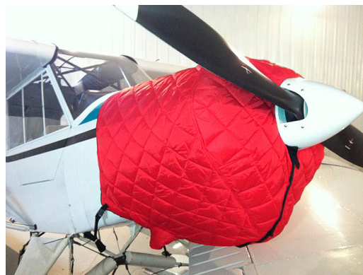
Piper Super Cub Insulated Engine Cover

Engine Inlet Plugs are custom fit for your Piper PA-11 Cub Special intakes, made with heavy-duty vinyl material, and stuffed with a single block of sculpted urethane foam. Each plug has a zipper that allows the foam to be removed and dried if necessary. Engine plugs have warning flags that are visible from the cockpit or 'remove before flight' streamers sewn onto the face of the plugs. Most plugs are imprinted with the aircraft registration number in black for an extra charge. Storage bag NOT included. Engine plugs may be inserted after flight when the engine is still warm. Engine Inlet Plugs are commonly referred to as Cowl Plugs, Intake Plugs, Cowl Blocks, Engine Blocks, and Engine Bungs.