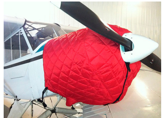
Piper Super Cub Insulated Engine Cover