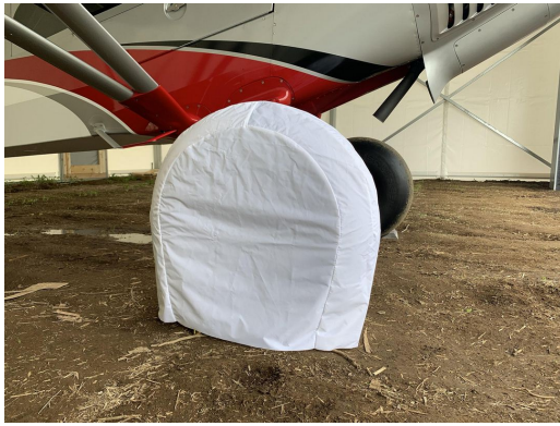
Cub Crafters CC19 Oversize Tire Covers, test fit cover