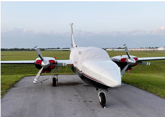
Piper PA-601 Aerostar Canopy Cover (Windows Only), Engine Plugs

The Piper PA-601 Aerostar Nose Cover is designed to cover the section of the fuselage forward of the windshield to the tip of the nose. It is secured with belly strapsThis cover type is made from Silver Acrylic Sunbrella canvas and is 100% lined with a soft and smooth microfiber. Bruce's Custom Covers developed this material combination especially for aircraft protection. The outer material is medium weight and treated for water resistance, UV resistance and anti-static buildup. The inner lining is a very soft and smooth microfiber to prevent scratching. The material is very reflective, and tests show that the cabin interior temperature can be reduced to near-ambient temperature on the hottest of days. It is water, ice and snow repellent, yet breathable to allow moisture to escape from between the cover and the aircraft surface.