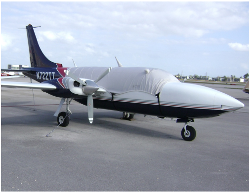
Aerostar Canopy Cover