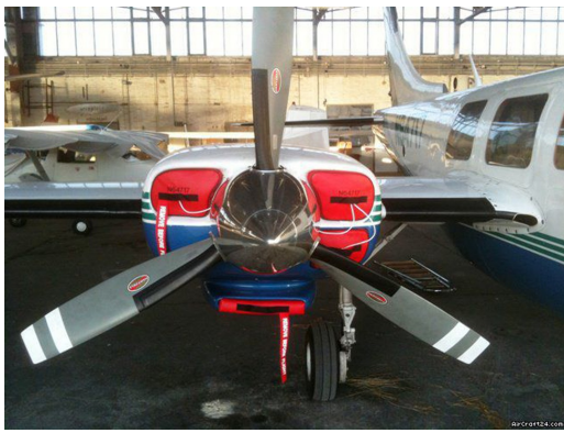
Aerostar Engine Inlet Plugs