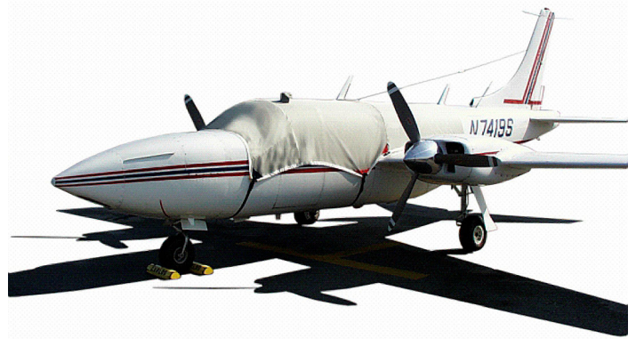
Aerostar Canopy Cover