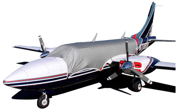
Aerostar Canopy Cover & Plugs