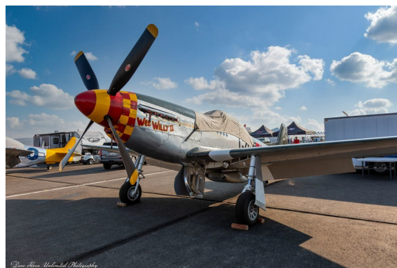
North American P-51 Canopy Cover