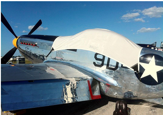
North American P51 Canopy Cover