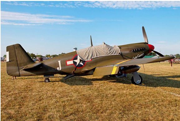
North American P-51A Canopy Cover