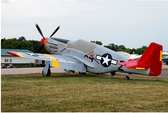
Tuskegee Airmen P51 Canopy Cover

non-travel Sunbrella Cover is the best choice.