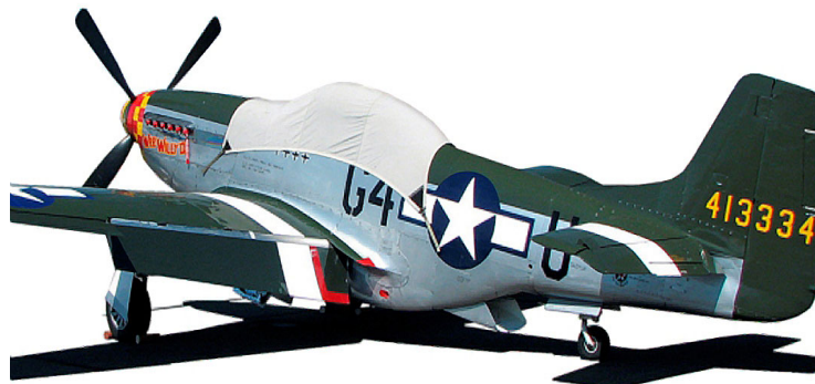
North American P51 Canopy Cover & Exhaust Plugs