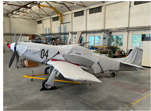
North American Mustang P51 Engine Cover