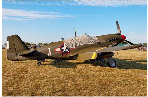
North American P-51A Canopy Cover