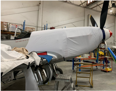
North American P51 Engine Cover, test fit cover