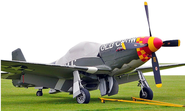
Canopy Cover, Chin Scoop & Exhaust Plugs

This cover type is made from Silver Acrylic Sunbrella canvas and is 100% lined with a soft and smooth microfiber. Bruce's Custom Covers developed this material combination especially for aircraft protection. The outer material is medium weight and treated for water resistance, UV resistance and anti-static buildup. The inner lining is a very soft and smooth microfiber to prevent scratching. The material is very reflective, and tests show that the cabin interior temperature can be reduced to near-ambient temperature on the hottest of days. It is water, ice and snow repellent, yet breathable to allow moisture to escape from between the cover and the aircraft surface.