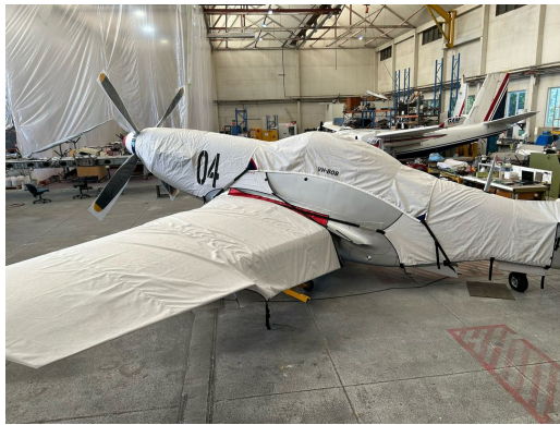
North American Mustang P51 Engine Cover

This cover type is made from Silver Acrylic Sunbrella canvas and is 100% lined with a soft and smooth microfiber. Bruce's Custom Covers developed this material combination especially for aircraft protection. The outer material is medium weight and treated for water resistance, UV resistance and anti-static buildup. The inner lining is a very soft and smooth microfiber to prevent scratching. The material is very reflective, and tests show that the cabin interior temperature can be reduced to near-ambient temperature on the hottest of days. It is water, ice and snow repellent, yet breathable to allow moisture to escape from between the cover and the aircraft surface.