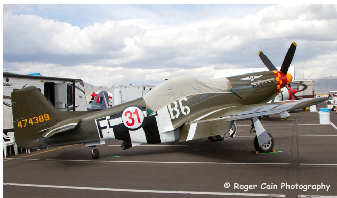
North American P-51 Canopy Cover

This cover type is made from Silver Acrylic Sunbrella canvas and is 100% lined with a soft and smooth microfiber. Bruce's Custom Covers developed this material combination especially for aircraft protection. The outer material is medium weight and treated for water resistance, UV resistance and anti-static buildup. The inner lining is a very soft and smooth microfiber to prevent scratching. The material is very reflective, and tests show that the cabin interior temperature can be reduced to near-ambient temperature on the hottest of days. It is water, ice and snow repellent, yet breathable to allow moisture to escape from between the cover and the aircraft surface.