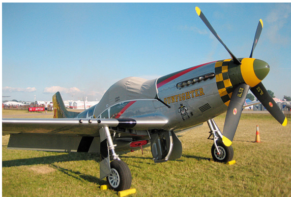
North American P51 Canopy Cover & Belly Scoop Plug

Engine Inlet Plugs are custom fit for your North American Mustang P51 intakes, made with heavy-duty vinyl material, and stuffed with a single block of sculpted urethane foam. Each plug has a zipper that allows the foam to be removed and dried if necessary. Engine plugs have warning flags that are visible from the cockpit or 'remove before flight' streamers sewn onto the face of the plugs. Most plugs are imprinted with the aircraft registration number in black for an extra charge. Storage bag NOT included. Engine plugs may be inserted after flight when the engine is still warm. Engine Inlet Plugs are commonly referred to as Cowl Plugs, Intake Plugs, Cowl Blocks, Engine Blocks, and Engine Bungs.