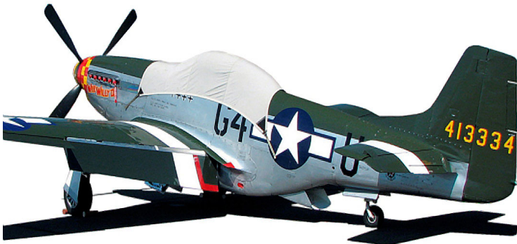
North American P51 Canopy Cover & Exhaust Plugs