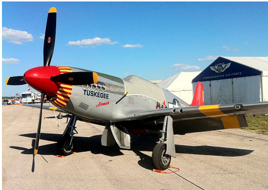
North American P51 Canopy Cover, Tuskegee Airmen model

non-travel Sunbrella Cover is the best choice.