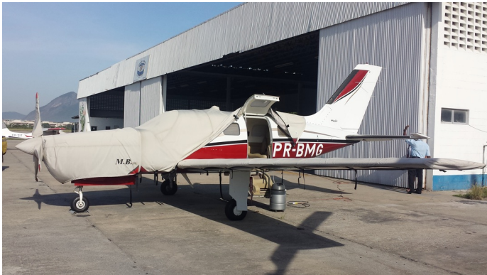
Piper Malibu/Mirage Extended Canopy Cover, Engine, Prop & Wing Covers

This cover type is made from Silver Acrylic Sunbrella canvas and is 100% lined with a soft and smooth microfiber. Bruce's Custom Covers developed this material combination especially for aircraft protection. The outer material is medium weight and treated for water resistance, UV resistance and anti-static buildup. The inner lining is a very soft and smooth microfiber to prevent scratching. The material is very reflective, and tests show that the cabin interior temperature can be reduced to near-ambient temperature on the hottest of days. It is water, ice and snow repellent, yet breathable to allow moisture to escape from between the cover and the aircraft surface.