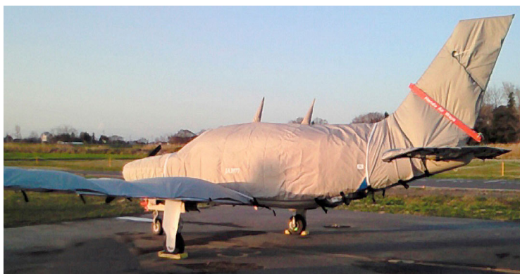
Piper PA-46 Malibu Complete Cover Set