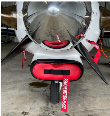
Piper Malibu JetProp Inlet Plugs

This cover type is made from Silver Acrylic Sunbrella canvas and is 100% lined with a soft and smooth microfiber. Bruce's Custom Covers developed this material combination especially for aircraft protection. The outer material is medium weight and treated for water resistance, UV resistance and anti-static buildup. The inner lining is a very soft and smooth microfiber to prevent scratching. The material is very reflective, and tests show that the cabin interior temperature can be reduced to near-ambient temperature on the hottest of days. It is water, ice and snow repellent, yet breathable to allow moisture to escape from between the cover and the aircraft surface.