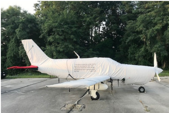
Piper Malibu, Mirage, Meridian Extended Canopy, Engine, Empennage & Wing Covers.