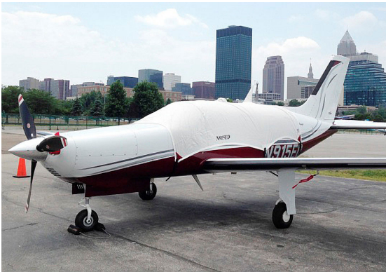
Piper Mirage Canopy Cover, Engine Plugs