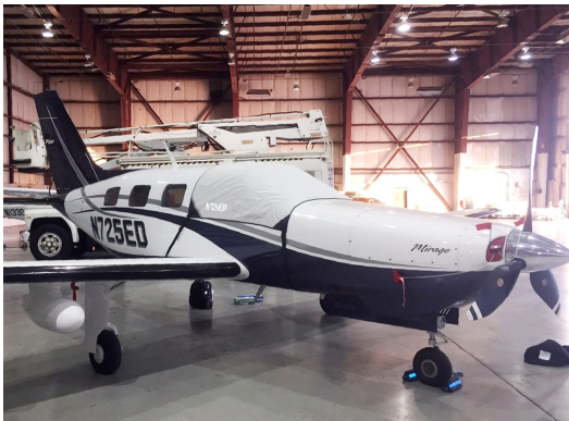
Piper Malibu/Mirage Cockpit Cover, Engine Plugs

Engine Inlet Plugs are custom fit for your Piper PA-46-350P Mirage, Matrix, JetProp intakes, made with heavy-duty vinyl material, and stuffed with a single block of sculpted urethane foam. Each plug has a zipper that allows the foam to be removed and dried if necessary. Engine plugs have warning flags that are visible from the cockpit or 'remove before flight' streamers sewn onto the face of the plugs. Most plugs are imprinted with the aircraft registration number in black for an extra charge. Storage bag NOT included. Engine plugs may be inserted after flight when the engine is still warm. Engine Inlet Plugs are commonly referred to as Cowl Plugs, Intake Plugs, Cowl Blocks, Engine Blocks, and Engine Bungs.