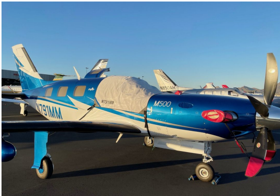
Piper M500 Cockpit Cover

Travel Covers are made with Silver Solution-Dyed Polyester fabric and only lined over the windshield to save weight. The material is lightweight and more compact for easy stowage in the aircraft. The polyester material is water resistant, but only intended for occasional use outside. We also have an ultra lightweight material available for fitted hangar dust covers. For daily outdoor use, the non-travel Sunbrella Cover is the best choice.