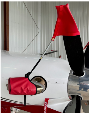
Piper Malibu JetProp Prop Tie & Exhaust Cover