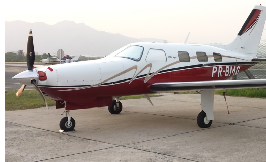
Piper Malibu/Mirage Engine Plugs, Cockpit HeatShields