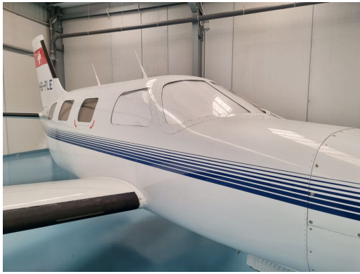
Piper PA-46 Malibu Cockpit Heatshields