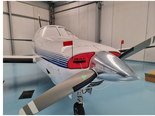
Piper PA-46 Malibu Engine Inlet Plugs