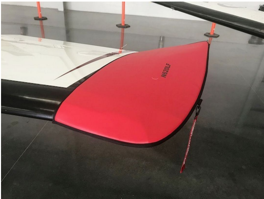
Piper Meridian Wingtip Pads, M600 Models