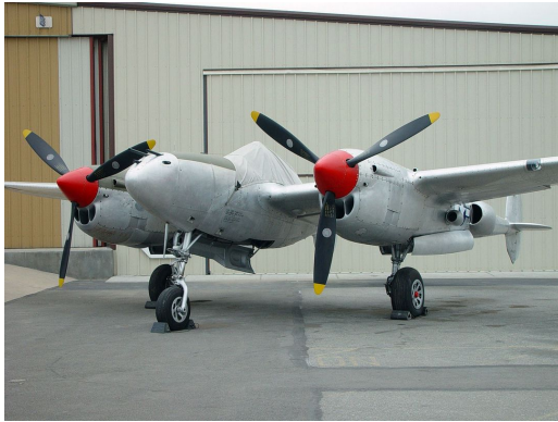
Lockheed P38 Lightning Canopy Cover

The material is very reflective, and tests show that the cabin interior temperature can be reduced to near-ambient temperature on the hottest of days. It is water, ice and snow repellent, yet breathable to allow moisture to escape from between the cover and the aircraft surface.