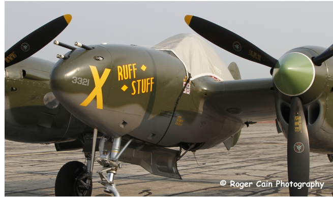
P38 Lightning Canopy Cover (snap-on type)