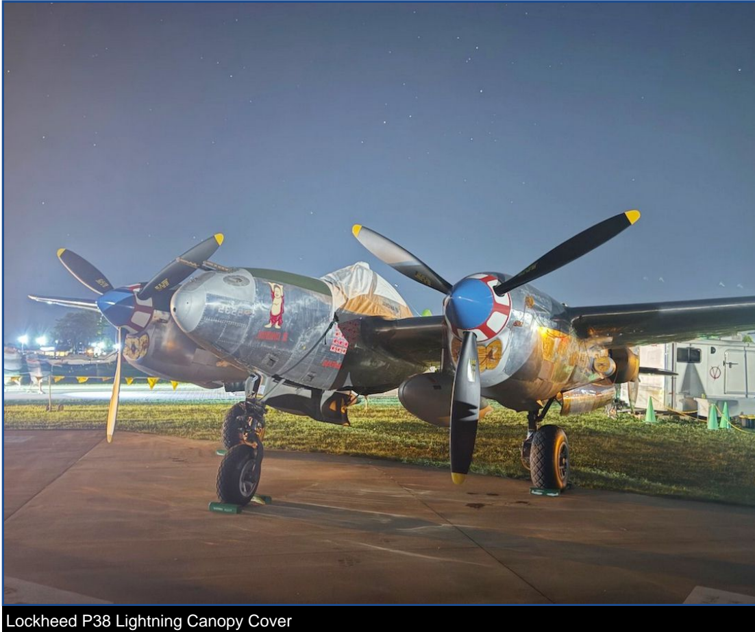
Lockheed P38 Lightning Canopy Cover